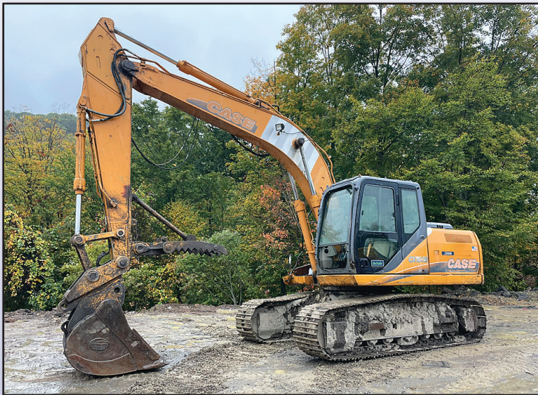
'11 CASE CX160B

2008 HITACHI Model ZX280LCN-3 Hydraulic Excavator , s/n 031755, powered by Isuzu 4 cylinder diesel engine and hydraulic drive, equipped with 10' dipper stick, 12' boom, Ostermeier model AG/SA 12' boom extension, s/n 420041, Kinshofer 38" x 54" clam grapple (rotation no working), 2.8 ton additional counterweight, rearview camera, auxiliary hydraulics, and 23-3/4" TBG pads. In good condition with good undercarriage. (Boom Cracked; Extension Cracked)