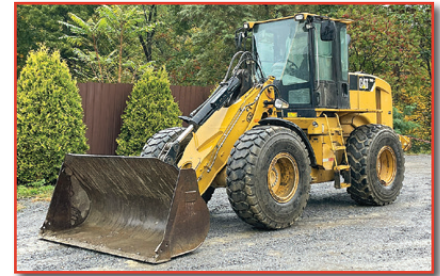
‘10 CAT 930H

PRE-SORTED FIRST CLASS MAIL US POSTAGE PAID UPPER DARBY, PA PERMIT #45