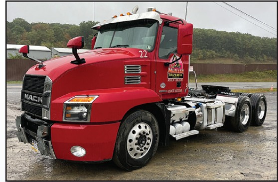
(1) OF (2) '20 MACK AN64T ANTHEM

2020 MACK Model AN64T Anthem Tandem Axle Truck Tractor , powered by MP8, 505HP diesel engine and automatic transmission, equipped with 40,000# rears, 12,000# front axle, wetline, air slide pin-able 5th wheel, air ride suspension, single frame, aluminum wheels, def system, 3-stage engine brake, 185" wheelbase, power windows and locks, power heated mirrors, cruise control, air conditioning, and 11R22.5 tires. In good to very good condition with good tires. (161,466 Miles)