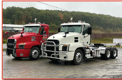
‘20 AND ‘19 MACK AN64T

1440 COWPATH RD. • HATFIELD, PA 19440 215/361-9099 • Fax: 215/361-9212 www.hunyady.com