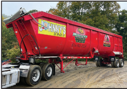
'20 JMH 42' FRAMELESS

2020 JMH Model J4299DBMAH, 42' Tandem Axle Frameless Dump Trailer , equipped with tub style steel dump body with swing gate, electric tarp, Hardox lining, 70,000# GVWR, spring suspension, aluminum wheels, and 11R22.5 tires. In good condition with fair to good tires. (Tailgate Damage; One Tarp Arm Broken; Landing Gear Bottom Plates Bent; Aluminum Tarp Cover Damaged)