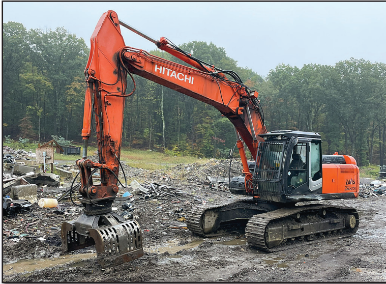
'08 HITACHI ZX280LCN-3

2008 HITACHI Model ZX280LCN-3 Hydraulic Excavator , s/n 031755, powered by Isuzu 4 cylinder diesel engine and hydraulic drive, equipped with 10' dipper stick, 12' boom, Ostermeier model AG/SA 12' boom extension, s/n 420041, Kinshofer 38" x 54" clam grapple (rotation no working), 2.8 ton additional counterweight, rearview camera, auxiliary hydraulics, and 23-3/4" TBG pads. In good condition with good undercarriage. (Boom Cracked; Extension Cracked)