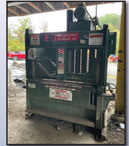
PHILADELPHIA TRAMRAIL BALER

PHILADELPHIA TRAMRAIL Hydraulic Baler, s/n J94T6951, powered by 3HP, 3-phase electric motor, equipped with 60" x 36" x 48" high chamber. In good condition.