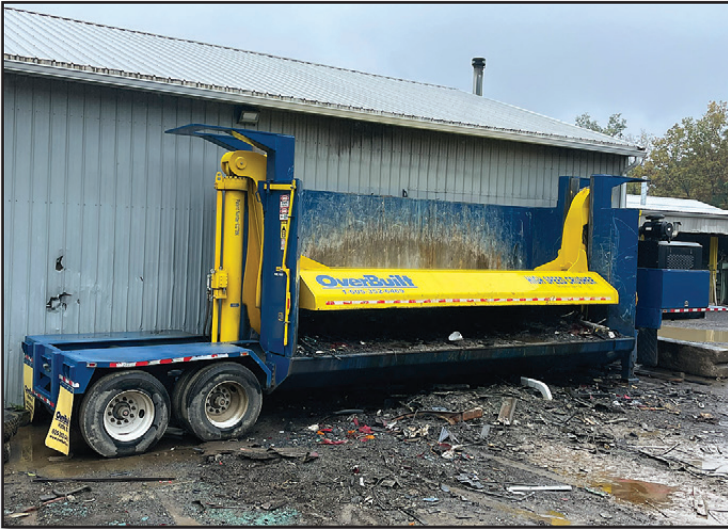
19 OVERBUILT 10-HS

2019 OVERBUILT Model 10-HS, 22' Portable High Speed Hydraulic Car Crusher , s/n 1ZPKU4520K1086708, powered by JD PE6068HF285 Tier 3 diesel engine, equipped with 159 ton crushing force, optional 22' charge box with 10' opening, two crushing cycles – flat and rocking, auto up cycle, high speed oil bypass system, oil recovery system with dual sludge traps, water separating valve and 400 gallon on-board waste oil storage tank, on-board air compressor with 100' hose reel, wireless remote control, 400 gal. fuel tank with auxiliary transfer pump with hose and filling nozzle, hydraulic landing gear, and 11R22.5 tires. In good to very good condition. (753 Hours)