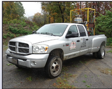
'07 RAM 3500HD 4X4

powered by Cummins diesel engine and automatic transmission, equipped with 8' bed with spray-on liner, 100 gallon fuel cell with electric pump, torch set with bottle cage, rear window guard, dual rear wheels, tow package, power windows, locks, and mirrors, cruise control, air conditioning, and 235/85R17 tires. In fair to good condition with good tires. (Reconstructed Title)