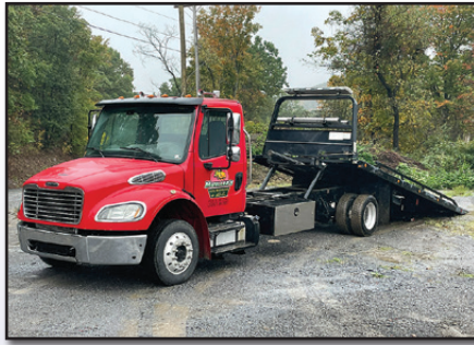
'15 FREIGHTLINER ROLLBACK

powered by Cummins 6 cylinder diesel engine and automatic transmission, equipped with Jerr-Dan model 22SRR6T-W-LP, 12,000# capacity, 22' rollback body, s/n 0220007579, 25,500# GVWR, rear tow bar, dolly wheels, aluminum wheels, def system, power windows and locks, power heated mirrors, cruise control, air conditioning, and 245/70R19.5 tires. In good condition with good tires.