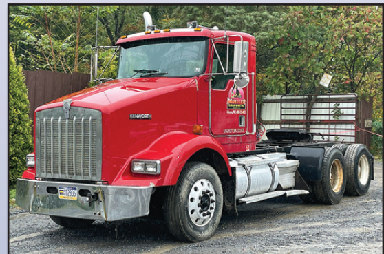
'99 KENWORTH T800

1999 KENWORTH Model T800 Tandem Axle Truck Tractor , powered by Cat 3406 diesel engine and Fuller 10 speed transmission, equipped with wetline, air slide 5th wheel, air ride suspension, single frame, 3-stage engine brake, 190" wheelbase, aluminum front wheels, cruise control, air conditioning, and 275/80R22.5 tires. In fair to good condition with good tires.