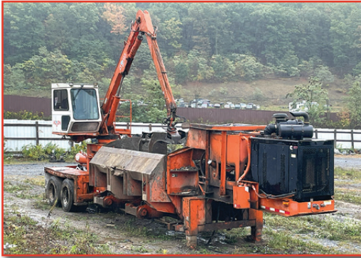
‘12 AL-JON 400XL

PRE-SORTED FIRST CLASS MAIL US POSTAGE PAID UPPER DARBY, PA PERMIT #45