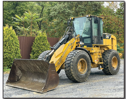
10 CAT 930H

2010 CATERPILLAR Model 930H Rubber Tired Loader , s/n DHC01761, powered by Cat/Perkins 6 cylinder diesel engine and powershift transmission, equipped with Cat general purpose loader bucket with bolt-on cutting edge, hydraulic coupler, auxiliary hydraulics, Tera model TR-1-NK-HE hydraulic bucket scale, enclosed ROPS cab with heat and air conditioning, and 20.5R25 tires. In good condition with good tires.