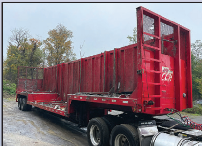
'13 JMH CRUSHED CAR TRAILER

2013 JMH Tandem Axle Double Drop Crushed Car Trailer , equipped with 13' front deck, 22' center well, 14' rear deck, cable tie down, spring suspension, and 295/75R22.5 tires. In good condition with good tires.