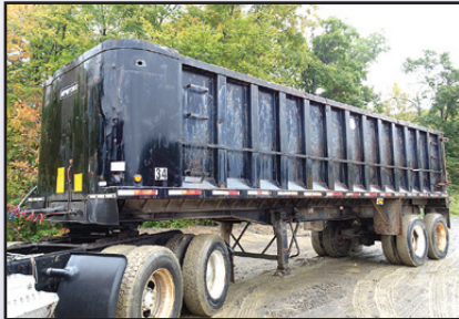
'07 MONTONE 30'

2007 MONTONE Model SD30606060, 30' Tandem Axle Dump Trailer , equipped with steel dump body with swing gate, spring suspension, 75,000# GVWR, and 11R24.5 tires. In fair to good condition with good tires. (Missing 2 Tires)