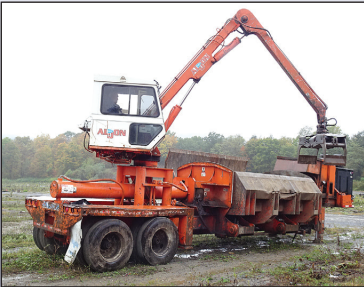
12 AL-JON 400XL

2019 OVERBUILT Model 10-HS, 22' Portable High Speed Hydraulic Car Crusher , s/n 1ZPKU4520K1086708, powered by JD PE6068HF285 Tier 3 diesel engine, equipped with 159 ton crushing force, optional 22' charge box with 10' opening, two crushing cycles – flat and rocking, auto up cycle, high speed oil bypass system, oil recovery system with dual sludge traps, water separating valve and 400 gallon on-board waste oil storage tank, on-board air compressor with 100' hose reel, wireless remote control, 400 gal. fuel tank with auxiliary transfer pump with hose and filling nozzle, hydraulic landing gear, and 11R22.5 tires. In good to very good condition. (753 Hours)