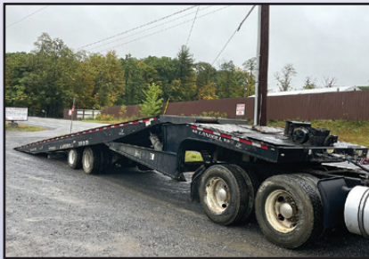
'20 LANDOLL 40 TON

2020 LANDOLL Model 440BNG, 40 Ton Tandem Axle Hydraulic Tilt Trailer , equipped with 20,000# hydraulic winch, 7' top deck, 32" transition, 40' main deck, 97,000# GVWR, (6) aluminum and (1) steel wheels, Air-Weigh trailer scale, and 235/75R17.5 tires. In good condition with good tires. (Deck Fair)