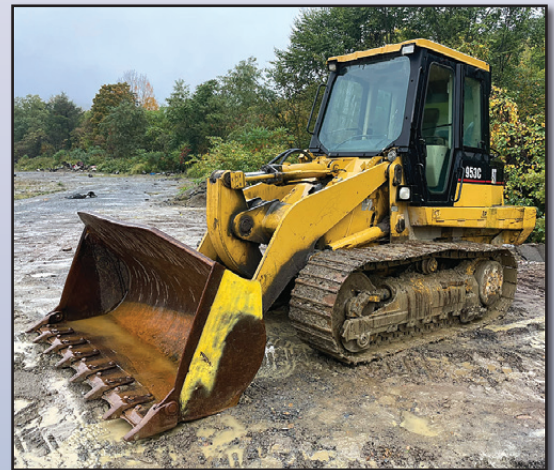
98 CAT 953C

1998 CATERPILLAR Model 953C Crawler Loader , s/n 2ZN01819, powered by Cat 3116 diesel engine and hydrostatic transmission, equipped with general purpose loader bucket with teeth and bolt-on segments, enclosed ROPS cab with heat and air conditioning, and 20" DBG pads.