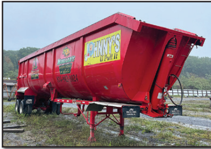
'20 JMH 42' FRAMELESS

2020 JMH Model J4299DBMAH, 42' Tandem Axle Frameless Dump Trailer , equipped with tub style steel dump body with swing gate, wired for electric tarp, Hardox lining, 70,000# GVWR, spring suspension, aluminum wheels, and 11R22.5 tires. In good condition with fair to good tires.