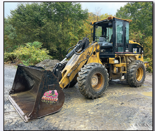
00 CAT 924G

2000 CATERPILLAR Model 924G Rubber Tired Loader , s/n 9SW00718, powered by Cat 3056 diesel engine and powershift transmission, equipped with Cat general purpose loader bucket with bolt-on cutting edge, hydraulic coupler, auxiliary hydraulics, enclosed ROPS cab with heat, and 17.5x25 tires.