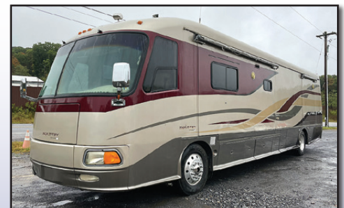
'01 NEWMAR-SPARTAN 42'

2001 NEWMAR/ SPARTAN Model MM2242 Kountry Aire, 42' Motor Home , powered by Cummins ISC, 350HP diesel engine and Allison automatic transmission, equipped with computerized leveling system, rearview monitor, heater mirrors, full kitchen, washer and dryer, (1) bedroom, (2) pushouts, lavatory with shower, cruise control, air conditioning, and 275/80R22.5 tires. In good condition with good tires. (32,341 Miles)