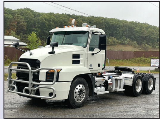
'19 MACK AN64T ANTHEM

2019 MACK Model AN64T Anthem Tandem Axle Truck Tractor , powered by MP8, 505HP diesel engine and automatic transmission, equipped with 40,000# rears, 12,000# front axle, air slide 5th wheel, air ride suspension, single frame, aluminum wheels, def system, 3-stage engine brake, 185" wheelbase,