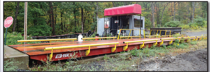
B-TEK 200,000# TRUCK SCALE

B-TEK Model BT-7211-200-FESD-SL-A, 200,000# Pitless Truck Scale , s/n TS-03198009, equipped with 11' x 72' 3-section steel deck, B-Tek model DD700 digital readout, ticket printer, outside readout, 20' overseas storage container/scale house with man door, front window, and window air conditioning unit. In good condition.