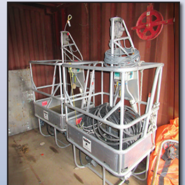
(2) SPIDER ST-180 HOIST BASKETS