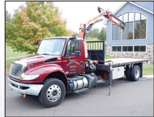
'17 INTERNATIONAL 4300 WITH PALFINGER PK8501

2017 INTERNATIONAL Model 4300 Single Axle Knuckleboom Truck , powered by Cummins ISB6.7, 300HP diesel engine and automatic transmission, equipped with 2009 Palfinger PK8501 knuckleboom crane, 3-section hydraulic boom to 24', 18' flatbed, ratchet straps, (2) hydraulic outriggers, spring/air suspension, 19,000# rear axle, 11,000# front axle, aluminum wheels, cruise control, air conditioning, and 11R22.5 tires. In good condition with good tires.