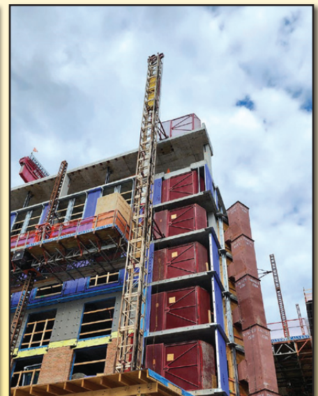
HENLEY EAST - WASHINGTON, DC