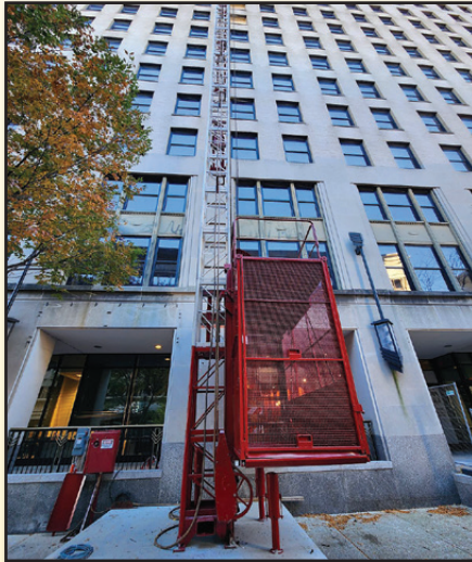
NEUMOURS - WILMINGTON, DE