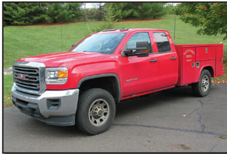
'17 GMC SIERRA 3500 4X4

2017 GMC Model Sierra 3500, 4x4 Extended Cab Utility Truck , powered by 6.0L gas engine and automatic transmission, equipped with 8' Reading utility body, tow package, power windows, locks, and mirrors, air conditioning, and 265/70R16 tires. In good condition with good tires.