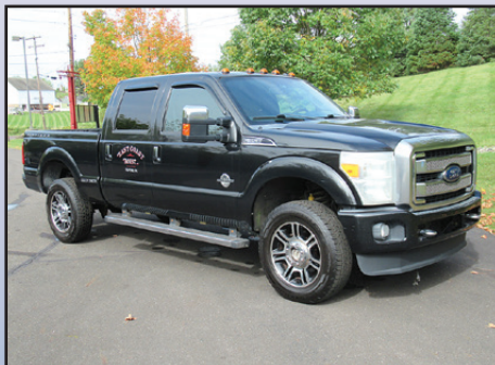
'14 FORD F-350 LARIAT SD 4X4

2014 FORD Model F-350 Lariat Super Duty, 4x4 Crew Cab Pickup Truck , powered by Powerstroke 6.7L diesel engine and automatic transmission, equipped with 6.5' bed, Platinum Edition, full power package, sun roof, leather interior, and navigation. In good condition with good tires.