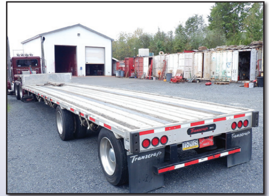
'17 TRANSCRAFT 554C, 48' STEP DECK

2017 TRANSCRAFT Model 554C, 48' Spread Axle Step Deck Trailer , equipped with 11' upper deck, 37' lower deck, 102" width, aluminum deck, 10'2" spread axle, air ride suspension, aluminum wheels, ABS braking, and 80,000# GVWR. In good condition with good tires.