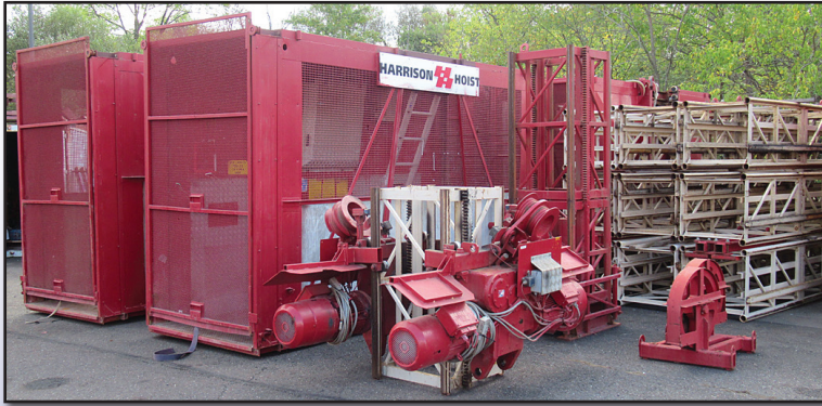
(10) COMPLETE HOIST SYSTEMS

(10) Complete Hoist Systems: (10) TORNBORG FC-8000 & FC-7000 Dual Car Complete Hoist Systems will be sold as individual systems, with each lot containing; (2) Hoist Cars and Motors, Control Panels, 200' of Tower, Tower Bases, and Tower Ties.