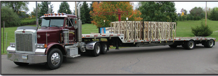
'95 PETERBILT 379 AND '03 TRANSCRAFT 48' STEP DECK

1995 PETERBILT Model 379 Tandem Axle Truck Tractor , powered by Cat 3406 diesel engine and Eaton Fuller 10 speed transmission, equipped with air slide 5th wheel, single frame, 3-stage engine brake, Peterbilt Air Leaf suspension, 38,000# rear and 12,000# front axles, aluminum wheels, heated mirrors, cruise control, air-conditioning, and 295/75R22.5 tires. In good condition with very good tires.