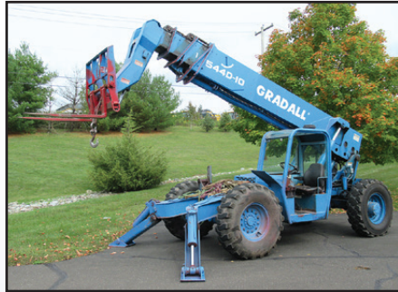
'02 GRADALL 544D-10, 10,000# 4X4

2002 GRADALL Model 544D-10, 10,000# 4x4 Rough Terrain Telescopic Forklift , s/n 0365166, powered by Cummins diesel engine and shuttle transmission, equipped with 55' 3-section telescopic boom, 48" forks, 4-wheel steering, (2) hydraulic stabilizers, ROPS canopy, and 14.00-24 tires. In good condition with good tires.