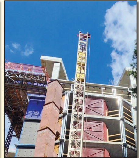
HENLEY WEST - WASHINGTON, DC