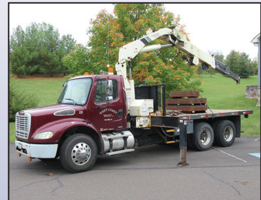
'05 FREIGHTLINER BUSINESS CLASS M2 WITH NATIONAL N100

2005 FREIGHTLINER Model Business Class M2 112 Tandem Axle Knuckleboom Truck , powered by Mercedes OM460, 450HP diesel engine and Eaton Fuller 10 speed transmission, equipped with National Crane N100/31-38, 13,750# knuckleboom crane, 3-section hydraulic boom with manual fly to 38', 16'6" flatbed, (2) hydraulic stabilizers, engine brake, tow package with air, spring suspension, 40,000# rear and 14,600# front axles, aluminum wheels, cruise control, air-conditioning, and 11R22.5 tires. In good condition with good tires.