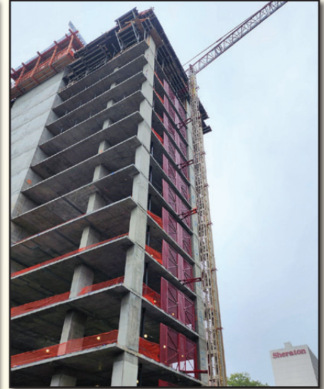
THE MARK - PHILADELPHIA, PA