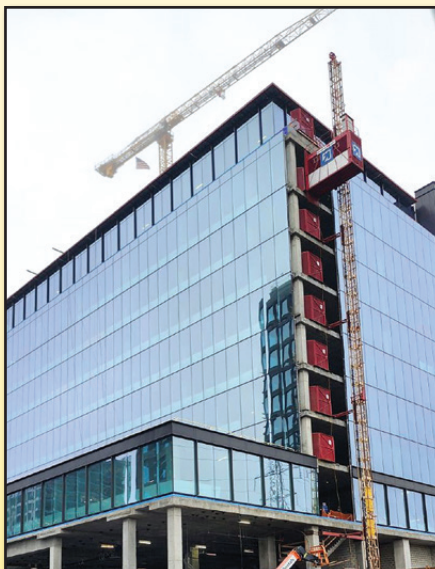
OB5 - RESTON, VA