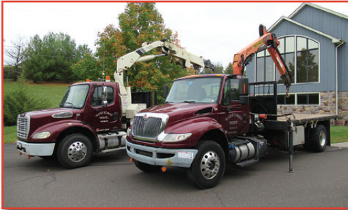
(2) KNUCKLEBOOM TRUCKS

PRE-SORTED FIRST CLASS MAIL US POSTAGE PAID UPPER DARBY, PA PERMIT #45