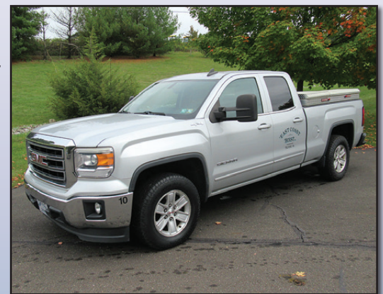
'15 GMC SIERRA 1500 SLE 4X4

2015 GMC Model Sierra 1500 SLE, 4x4 Extended Cab Pickup Truck , powered by 5.3L gas engine and automatic transmission, 6.5' bed with cross box and side mounted tool boxes, tow package, power package, and air conditioning. In good condition with good tires.