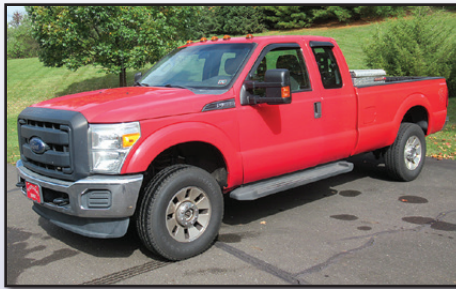
'16 FORD F-350 XL SD 4X4

2016 FORD Model F-350 XL Super Duty 4x4 Extended Cab Pickup Truck , powered by 6.2L gas engine and automatic transmission, equipped with 8' bed with cross tool box, tow package with electric, power window and locks, cruise control, air conditioning, and LT275/70R18 tires. In good condition with very good tires.