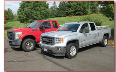
(2) OF (5) 4X4 PICKUPS