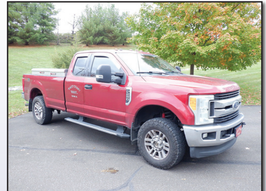
'17 FORD F-250 XLT 4X4

2017 FORD Model F-250 XLT, 4x4 Extended Cab Pickup Truck , powered by 6.2L gas engine and automatic transmission, equipped with 8' bed with cross and side mounted tool boxes, tow package, power package, air conditioning, and LT275/70R18 tires. In good condition with good tires.