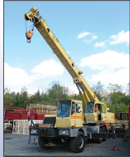
'85 GROVE TMS520B, 20 TON

1985 GROVE Model TMS520B, 20 Ton Hydraulic Truck Crane , s/n 68466, powered by Detroit 8.2L diesel engine and Fuller Roadranger 13 speed transmission, equipped with 32'-80' 3-section hydraulic boom, Kruger anti-two-block, single hoist, 20 ton 3-sheave hook block, weighted hook ball, (4) hydraulic outriggers, front stabilizer, 11R22.5 rear and 425/65R22.5 front tires. In good condition with fair to good tires.