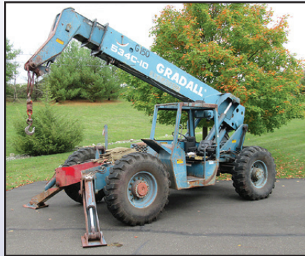
'96 GRADALL 534C-10, 10,000# 4X4

1996 GRADALL Model 534C-10, 10,000# 4x4 Rough Terrain Telescopic Forklift , s/n 0266041, powered by Cummins diesel engine and shuttle transmission, equipped with 40' 3-section telescopic boom, 48" forks (not mounted), 4-wheel steering, (2) hydraulic stabilizers, ROPS canopy, and 14.00-24 tires. In fair to good condition with fair to good tires.