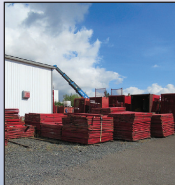
DOORS AND SCREENS