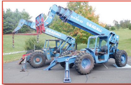
(2) 10,000# GRADALLS

1440 COWPATH RD. • HATFIELD, PA 19440 215/361-9099 • Fax: 215/361-9212 www.hunyady.com