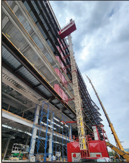
ESSEX COURT HOUSE - NEWARK, NJ

Model FC-7000 Dual 7,000# Hoists, 325' height installed. (Rental Remaining – (9) Months)