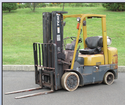
TCM FCG25-2H, 4,300#

TCM Model FCG25-2H, 4,300# Solid Tired Forklift , s/n A40M00157, powered by LP gas engine and shuttle transmission, equipped with 189" 3-stage mast, 42" forks, side shift, FOPS canopy, and non-marking solid tires. In good condition with good tires.