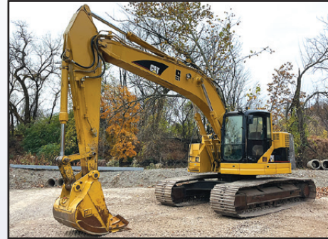
06 CAT 321C LCR

2006 CATERPILLAR Model 321C LCR Hydraulic Excavator , s/n MCF00963, powered by Cat 3066 diesel engine and hydraulic drive, equipped with 9'6" dipper stick, auxiliary hydraulics, Cat 44" digging bucket, enclosed cab with air conditioning, and 31.5" TBG pads. In good condition with good undercarriage.