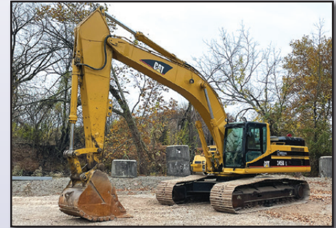
03 CAT 345BL

2003 CATERPILLAR Model 345BL Hydraulic Excavator , s/n AGS01804, powered by Cat 3176 diesel engine and hydraulic drive, equipped with 12'8" dipper stick, 46" digging bucket, thumb bracket, enclosed cab with air conditioning, and 35.5" TBG pads. In good condition with good undercarriage.