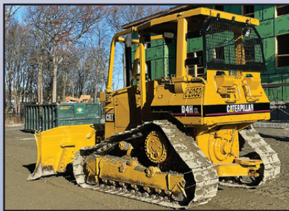
94 CAT D4H XL

1994 CATERPILLAR Model D4H XL Crawler Tractor , s/n 8PJ00622, powered by Cat 3304 diesel engine and powershift transmission, equipped with 6-way straight blade, drawbar, and ROPS canopy with sweeps and rear screen. In good condition with good undercarriage. 10' Hanging Root Rake Attachment (Cat D8N)