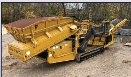
'05 EXTEC E7

2005 EXTEC Model E7 Crawler Screening Plant , s/n 9757, powered by Deutz air cooled diesel engine and hydraulic drive, equipped with feed hopper with belt feeder, 5'x15' 2-deck vibratory screen, (2) 28" folding side discharge conveyors, 46" rear discharge conveyor, and 15.5" TBG pads. In good condition with good undercarriage.