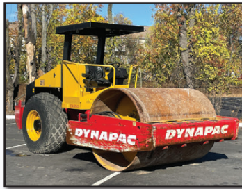
03 DYNAPAC CA250D

2003 DYNAPAC Model CA250D Vibratory Compactor , s/n 65221365, powered by Cummins diesel engine and hydrostatic transmission, equipped with 84" smooth drum, 2-speed vibration, ROPS canopy, and 23.1-26 tires. In good condition with fair tires.