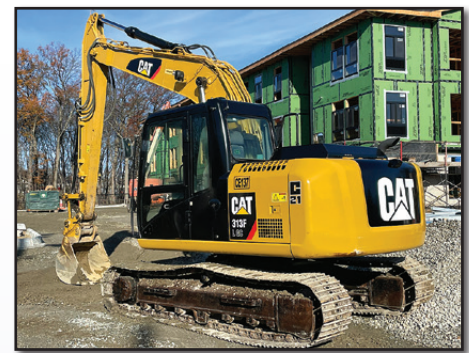
15 CAT 313F LGC

2015 CATERPILLAR Model 313F LGC Hydraulic Excavator , s/n HDK00199, powered by Cat C3.4B diesel engine and hydraulic drive, equipped with 9'6" dipper stick, auxiliary hydraulics, Cat 30" digging bucket, Cat hydraulic coupler, pattern changer, enclosed cab with air conditioning, rearview camera, and 20" TBG pads. In good condition with good undercarriage.