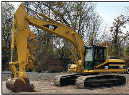
'97 CAT 325BL

1997 CATERPILLAR Model 325BL Hydraulic Excavator , s/n 2JR00855, powered by Cat 3116 diesel engine and hydraulic drive, equipped with 10'6" dipper stick, 48" digging bucket, thumb bracket, enclosed cab, and 31.5" TBG pads. In good condition with good undercarriage.