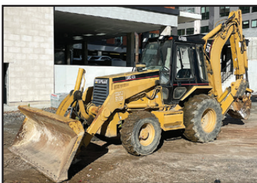
'00 CAT 446B, 4X4 E-HOE

Skid Steer Attachments: (2) 72" Hopper Brooms • 48" Fork Attachment 1988 DITCH WITCH Model 2310DD Trencher / Backhoe , s/n 3E0844, powered by diesel engine, equipped with 5' trencher attachment, backhoe attachment with 12" digging bucket, backfill blade, ROPS post, and 26x12.00-12 tires. In fair condition with fair to good tires.