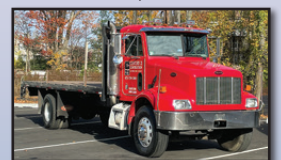
03 PETERBILT 330

2003 PETERBILT Model 330 Single Axle Flatbed Truck , powered by Cat 3126, 300HP diesel engine and Eaton Fuller 8LL, 10 speed transmission, equipped with Iroquois 24' steel flatbed body with ratchet straps, 3,000# electric lift gate, 33,000# GVWR, 23,000# rear and 10,000# front axle, air-ride suspension, locking differential, air brakes, aluminum wheels, air conditioning, cruise control, heated mirrors, and 11R22.5 tires. In good condition with good tires. (Odometer Reads 071,911 Miles)