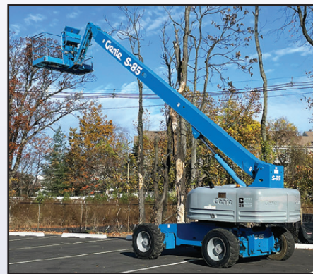
'06 GENIE S85, 85', 4X4