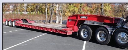
99 ROGERS 60 TON

1999 ROGERS Model SP60PL86/55/26/102/3XAR, 60 Ton Tri/Quad Axle Lowboy Trailer , equipped with non-ground bearing detachable gooseneck, 102"x26' level deck, 13' over axles, wetline, outriggers and chain dogs, 2010 Rogers flip-up 4th axle, and 275/70R22.5 tires. In very good condition and good tires.