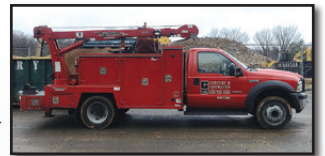
07 FORD F-550XL SD

2007 FORD Model F-550XL Super Duty Service Truck , powered by Power Stroke diesel engine and automatic transmission, equipped with Maintainer 10'6" service body with work bumper and vise, Maintainer 3216-