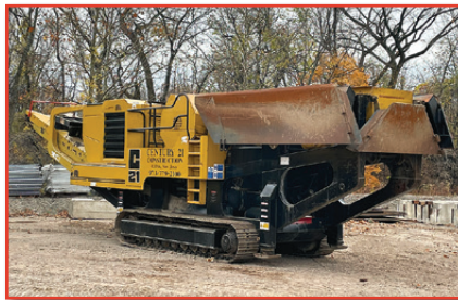
'02 EXTEC C12

1440 COWPATH RD. • HATFIELD, PA 19440 215/361-9099 • Fax: 215/361-9212 www.hunyady.com