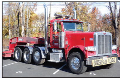
08 PETERBILT 389

2008 PETERBILT Model 389 Tri-Axle Truck Tractor , powered by Cat C-15, 475HP diesel engine and Eaton Fuller 18 speed transmission, equipped with 46,000# rears, wetline, double framed, air-ride suspension, air slide 5th wheel, aluminum wheels and fenders, headache rack with light package, air conditioning, cruise control, power windows, locks, and mirrors. In good to very good condition with good tires. (Odometer Reads 63,320 Miles)