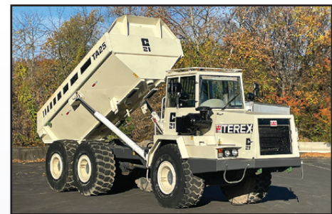
'99 TEREX TA25, 25 TON

1999 TEREX Model TA25, 25 Ton, 6x6 End Dump , s/n A7581252, powered by Cummins diesel engine and ZF powershift transmission, equipped with enclosed cab with air conditioning, companion seat, and 23.5R25 tires. In good condition with fair to good tires.