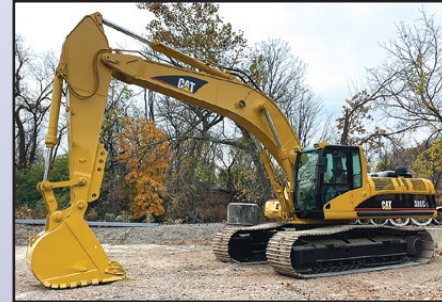
04 CAT 330CL

2004 CATERPILLAR Model 330CL Hydraulic Excavator , s/n CAP01567, powered by Cat diesel engine and hydraulic drive, equipped with 10'6" dipper stick, 42" digging bucket, thumb bracket, enclosed cab with air conditioning, and 33.5" TBG pads. In good condition with good to very good undercarriage.