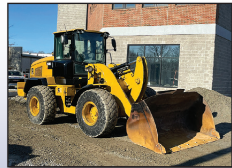
'12 CAT 938K

2012 CATERPILLAR Model 938K Rubber Tired Loader , s/n SWL00723, powered by Cat diesel engine and powershift / auto shift transmission, equipped with Cat general purpose loader bucket with bolt-on cutting edge, auxiliary hydraulics, hydraulic coupler, ride control, enclosed ROPS cab with air conditioning, rearview camera, and 20.5R25 tires. In good condition with good tires.