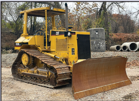
99 CAT D5M XL

1999 CATERPILLAR Model D5M XL Crawler Tractor , s/n 5ES00839, powered by Cat 3116 diesel engine and powershift transmission, equipped with 6-way straight blade, drawbar, fingertip controls, ROPS canopy, and 22" SBG pads. In good condition with very good undercarriage.