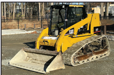
'03 CAT 277