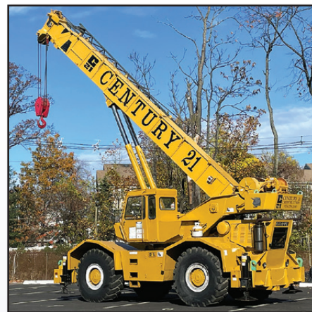
GROVE RT65S, 35 TON

ALLIS CHALMERS Model 600FL Rough Terrain Forklift , s/n 60011038FL, powered by gas engine and direct drive, 3-stage mast, 45" block forks, canopy, 16.9-24 front and 11L-16 rear tires. In good condition with fair to good tires.