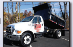
05 FORD F-750XL SD

2005 FORD Model F-750XL Super Duty, Single Axle Dump Truck , powered by Cat C7, 210 HP diesel engine and automatic transmission, equipped with Ledwell 10' steel dump body with single chute, manual tarp, 31,000# GVWR, 21,000# rear and 10,000#