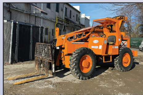
'88 LULL 844, 8,000#