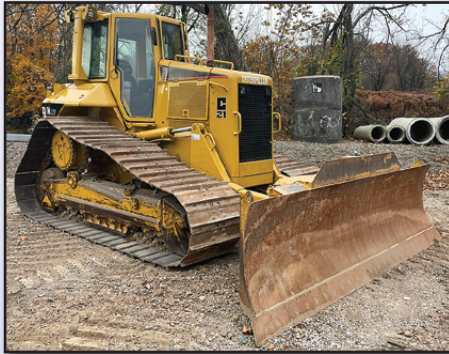
06 CAT D6N LGP

2006 CATERPILLAR Model D6N LGP Crawler Tractor , s/n ALY02491, powered by Cat 3126 diesel engine and powershift transmission, equipped with 6-way straight blade, drawbar, differential steering, ROPS over enclosed cab with air conditioning, and 34" SBG pads. In good condition with good to very good undercarriage.