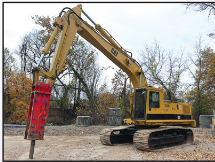
'85 CAT 235B AND ROCKBLASTER 1500G (HAMMER OFFERED SEPARATELY)

1985 CATERPILLAR Model 235B Hydraulic Excavator , s/n 64R02038, powered by Cat 3306 DI diesel engine and hydraulic drive, equipped with 12' dipper stick, auxiliary hydraulics, digging bucket, thumb bracket, enclosed cab, and 36" TBG pads. In good condition with good undercarriage. (Will Be Offered Separately And With Rockblaster Hammer As An Entirety)