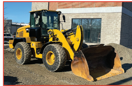
'12 CAT 938K

PRE-SORTED FIRST CLASS MAIL US POSTAGE PAID UPPER DARBY, PA PERMIT #45