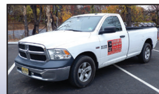
'16 RAM 1500

2013 BRI-MAR Model HT20D-14HD Tandem Axle Tilt Deck Trailer , equipped with 14,000# GVWR, spring suspension, 84"x4' stationary deck, 16'6" tilt deck, tie downs rings, electric brakes, and 235/80R16 tires. In good condition with fair to good tires.