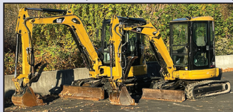
'05 CAT 303CR AND '02 CAT 301.6

2005 CATERPILLAR Model 303CR Mini Hydraulic Excavator , s/n DMA03985, powered by Mitsubishi 3 cylinder diesel engine and hydraulic drive, equipped with swing boom, 5' dipper stick, auxiliary hydraulics, Cat 18" digging bucket, Amulet hydraulic thumb, 61" backfill blade, enclosed cab, and 12" rubber tracks. In good condition with good undercarriage.