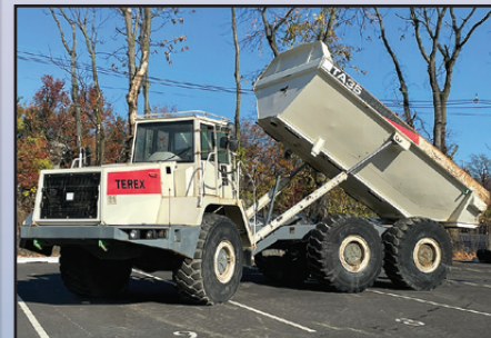
'99 TEREX TA35, 35 TON

1999 TEREX Model TA35, 35 Ton, 6x6 End Dump , s/n A7761096, powered by Detroit Series 60 diesel engine and ZF powershift transmission, equipped with enclosed cab with air conditioning, companion seat, and 26.5R25 tires. In good condition with fair tires.