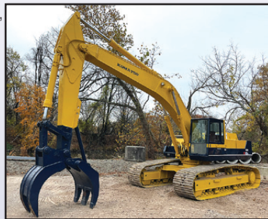
(1) OF (2) '86 KOMATSU PC400LC-3 (GRAPPLE SOLD SEPARATELY)

1986 KOMATSU Model PC400LC-3 Hydraulic Excavator , s/n 11546, powered by diesel engine and hydraulic drive, equipped with 10'6" dipper stick, Esco 60" digging bucket, thumb bracket, enclosed cab with air conditioning, and 29.5" TBG pads. In good condition with good undercarriage.