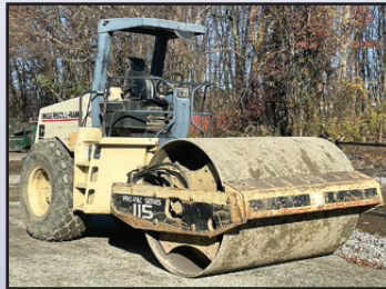
98 IR SD-115D PRO-PAC

84" Padfoot Shell Kit (Ingersoll-Rand SD115)