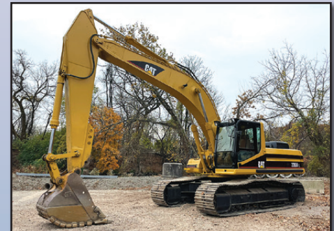
98 CAT 330BL

1998 CATERPILLAR Model 330BL Hydraulic Excavator , s/n 6DR02456, powered by Cat 3306B diesel engine and hydraulic drive, equipped with 12'6" dipper stick, Cat 46" digging bucket, thumb bracket, enclosed cab with air conditioning, and 33.5" TBG pads. In good condition with fair to good undercarriage.