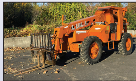
'95 LULL 844B, 8,000#