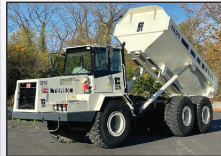
'99 TEREX TA25, 25 TON

1999 TEREX Model TA25, 25 Ton, 6x6 End Dump , s/n A7581189, powered by Cummins diesel engine and ZF powershift transmission, equipped with enclosed cab with air conditioning, companion seat, and 23.5R25 tires. In good condition with good tires.