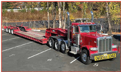
'08 PETERBILT 389 AND '99 ROGERS 60 TON

PRE-SORTED FIRST CLASS MAIL US POSTAGE PAID UPPER DARBY, PA PERMIT #45