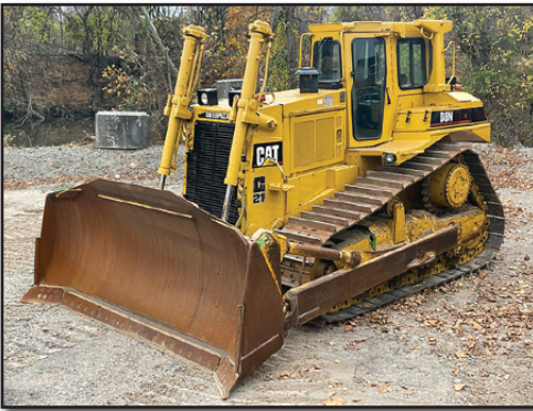
89 CAT D8N

1989 CATERPILLAR Model D8N Crawler Tractor , s/n 9TC03407, powered by Cat 3406 diesel engine and powershift transmission, equipped with straight blade with tilt, drawbar, 3rd valve, differential steering, ROPS over enclosed cab with air conditioning, and 28" SBG pads. In good condition with very good undercarriage.