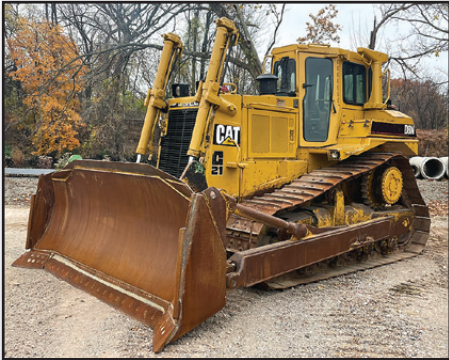
88 CAT D8N

1988 CATERPILLAR Model D8N Crawler Tractor , s/n 9TC02163, powered by Cat 3406 diesel engine and powershift transmission, equipped with straight blade with tilt, drawbar, differential steering, ROPS over enclosed cab with air conditioning, and 28" SBG pads. In good condition with good undercarriage.