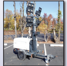
16 ATLAS COPCO V5+

2016 ATLAS COPCO Model V5+ Portable Light Plant , s/n WUX904976, VIN# YA302988XGW904976, powered by Kubota diesel engine, equipped with (4) LED lights, electric tower, and 155R3 tires. In very good condition with good tires.