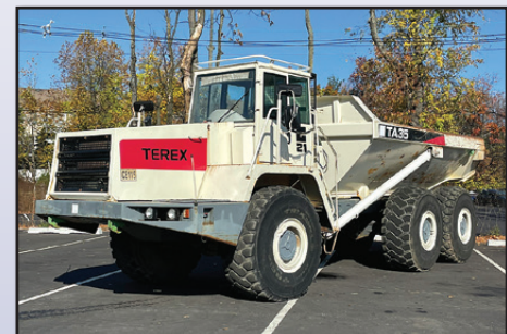
'99 TEREX TA35, 35 TON

1999 TEREX Model TA35, 35 Ton, 6x6 End Dump , s/n A7761095, powered by Detroit Series 60 diesel engine and ZF powershift transmission, equipped with enclosed cab with air conditioning, companion seat, and 26.5R25 tires. In good condition with good tires.