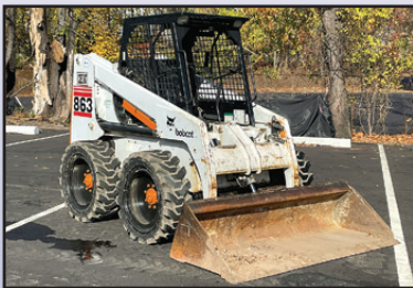
'98 BOBCAT 863