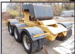
'02 EXTEC C12 AND TRANSPORT DOLLY

2005 EXTEC Model E7 Crawler Screening Plant , s/n 9757, powered by Deutz air cooled diesel engine and hydraulic drive, equipped with feed hopper with belt feeder, 5'x15' 2-deck vibratory screen, (2) 28" folding side discharge conveyors, 46" rear discharge conveyor, and 15.5" TBG pads. In good condition with good undercarriage.