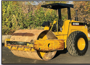
99 CAT CS-563C

1999 CATERPILLAR Model CS-563C Vibratory Compactor , s/n 4LN00905, powered by Cat 3116 DIT diesel engine and hydrostatic transmission, equipped with 84" smooth drum, 2-speed vibration, ROPS canopy, and 23.1-26 tires. In good condition with good tires.