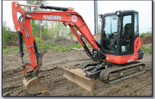
`14 KUBOTA KX040-4