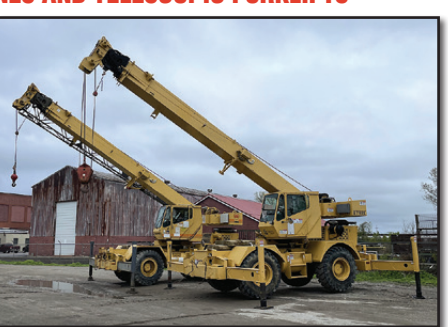
98 AND `91 GROVE RT528C, 28 TON

Crane, s/n 75996, powered by Cummins 5.9B diesel engine (recon) and powershift transmission, equipped with 28' - 70' 3-section boom, 25' swing away jib, Kruger antitwo block, single hoist, weighted hook, and 20.5-25 tires. In good condition with good tires. (Meter Reads 11.672 Hours)