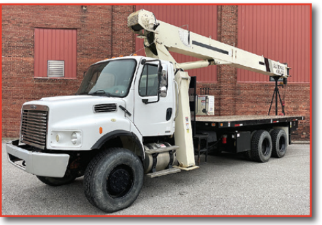
`07 FREIGHTLINER-NATIONAL 23 TON 6X6

1440 COWPATH RD. • HATFIELD, PA 19440 215/361-9099 • Fax: 215/361-9212 www.hunyady.com