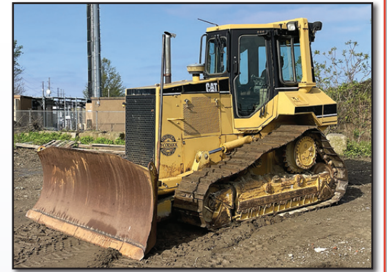
02 CAT D5M XL

Carrier, s/n 8CR03990, powered by Cat diesel engine and powershift transmission, equipped with Cat general purpose loader bucket, front auxiliary hydraulics, hydraulic coupler. enclosed ROPS cab with air conditioning, and 20.5-25 tires. In good condition with good tires. (Meter Reads 8,126 Hours) (Dealer Purchase Low Hours) Attachments: 66" Padfoot Shell Kit (Volvo SD70D) • PROTECH 14' Snow Pusher (Cat