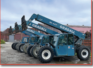
(4) GRADALL 6,000 LB Rough terrain telescopic