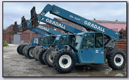
(4) GRADALL 6,000 LB ROUGH TÉRRAIN TELESCOPIC

Telescopic Forklift, s/n 0160026337, powered by JD diesel engine and hydraulic drive, equipped with 4-wheel drive, rear wheel steer, 3-section boom, auxiliary hydraulics, 48" forks, enclosed ROPS cab, and 370/75-28 foam filled tires. In good condition with fair to good tires. (Meter Reads 1,579 + 3,299 = 4,878 Hours)