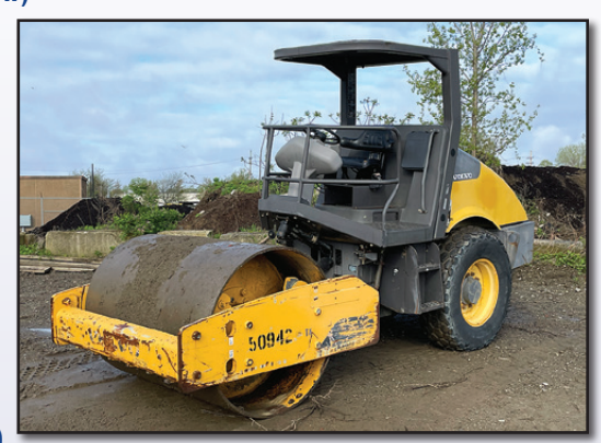
08 VOLVO SD70D