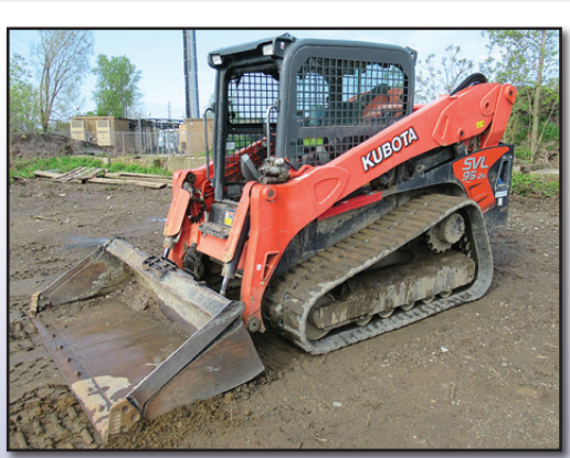
`19 KUBOTA SVL95-2S

ALLIÈD 24" Plate Compactor (Kubota 040) • NPK 24" Plate Compactor • PLUS: (15) Various Sized Excavator Cleanup and Digging Buckets