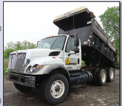
10 INT'L WORKSTAR 7400 SBA