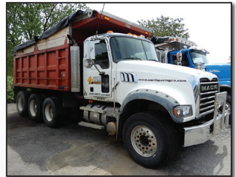
07 MACK CTP713 GRANITE

2010 INTERNATIONAL Model WorkStar 7400 SBA Tandem Axle Dump Truck , powered by Maxxforce 9, 330HP diesel engine and Allison automatic transmission, equipped with J&J 14'6" steel dump body with manual sliding tarp, 46,000 lb rear, 18,000 lb front axle, 64,000 lb GVWR, Hendrickson air ride suspension, tow package with air, cruise control, air conditioning, and 11R22.5 tires. In good condition with good tires. (Odometer Reads 173,515 Miles)