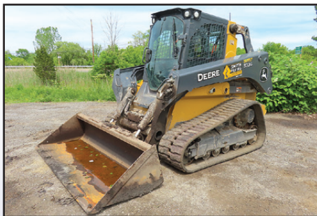
'22 JOHN DEERE 333G

2022 JOHN DEERE Model 333G Crawler Skid Steer , s/n 427468, powered by JD diesel engine and hydrostatic transmission, equipped with 84" general purpose loader bucket, power coupler, high flow hydraulics, 8-pin electric, joystick controls with pattern changer, enclosed ROPS cab with air conditioning, and rubber tracks. In good condition with good tracks. (Meter Reads 1,350 Hours) (Purchased New)