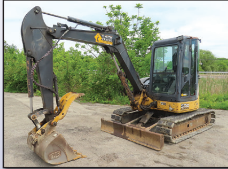
'12 JOHN DEERE 50D

2012 JOHN DEERE Model 50D Mini Hydraulic Excavator , s/n 276689, powered by JD diesel engine and hydraulic drive, equipped with 5'6" dipper stick, manual coupler, 36" digging bucket, swing boom, hydraulic thumb, 6'7" backfill blade, enclosed ROPS cab, and 16" bolt-on street pads. In good condition with good undercarriage. (Meter Reads 7,098 Hours) (Purchased New)