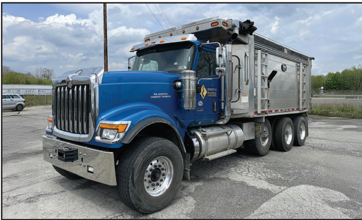
20 INT'L HX520SFA

2020 INTERNATIONAL Model HX520SFA Tri-Axle Dump Truck , powered by Cummins X15-565, 565HP diesel engine and Eaton Fuller Ultrashift Plus automatic transmission, equipped with Mac 19'6" smooth side aluminum body, sliding power tarp, 46,000 lb rear axles, 20,000 lb front axle, 20,000 lb lift axle, block/beam suspension, locking axles and differentials, engine brake, aluminum wheels, power windows, locks, and mirrors, cruise control, air conditioning, and 11R24.5 tires. In good to very good condition with good to very good tires. (Odometer Reads 123,038 Miles) (Purchased New)