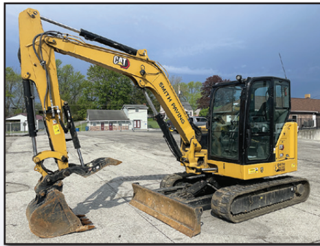
'23 CAT 306CR

2023 CATERPILLAR Model 306CR Mini Hydraulic Excavator , s/n C6G609915, powered by Cat diesel engine and hydraulic drive, equipped with 6'6" dipper stick with hydraulic coupler and auxiliary hydraulics, 24" digging bucket, swing boom, hydraulic thumb, 6'6" backfill blade with hydraulic angle, rear camera, pattern changer, enclosed ROPS cab, and 16" rubber tracks. In very good condition with good tracks. (Meter Reads 782 Hours) (Purchased New)