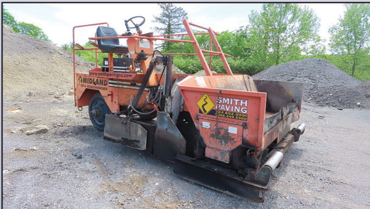
'10 MIDLAND SPR-6

2022 WEILER Model 385B Crawler Paver , s/n 003512, powered by Cat C3.4B diesel engine and hydraulic drive, equipped with 8' – 15'6" electric heated screed, manual crown, and washdown system. In good condition with good undercarriage. (Meter Reads 2,388 Hours) (Purchased New)