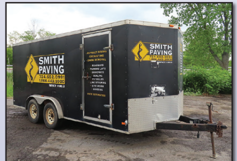
'08 CARGO EXPRESS

2008 CARGO EXPRESS Model Tandem Axle V-Nose Enclosed Utility Trailer , equipped with 16' x 7' enclosed body with fold down rear door, curbside door, electric brakes, 2-5/16" ball hitch, and 205/75R15 tires. In fair to good condition with good tires. (Purchased New)