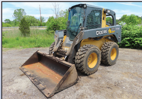
'13 JOHN DEERE 328D

2013 JOHN DEERE Model 328D Skid Steer , s/n 238324, powered by JD diesel engine and hydrostatic transmission, equipped with 84" general purpose loader bucket, manual coupler, standard hydraulics, 7-pin electric, joystick controls with pattern changer, enclosed ROPS cab with air conditioning, and 14-17.5 tires. In good condition with very good tires. (Meter Reads 5,171 Hours) (Purchased New)