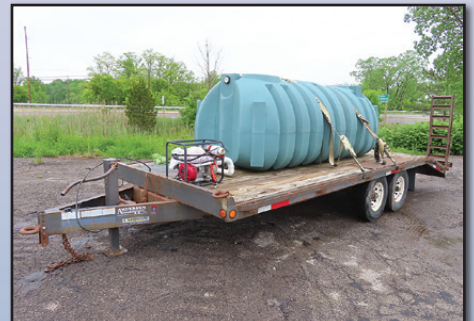
'10 ANDERSON (TANK AND PUMP SOLD SEPARATELY)

2010 ANDERSON Tandem Axle Tag-A-Long Trailer , equipped with 15' x 8' deck over wheels, 4' beavertail, ramps, and 235/80R16 tires. In good condition with good tires. (Tank and Pump in Photo Will Be Removed and Sold Separately) (2) 12' Snow Push Boxes (Backhoe) • (2) WESTERN 7'6" Snow Plows with Lights