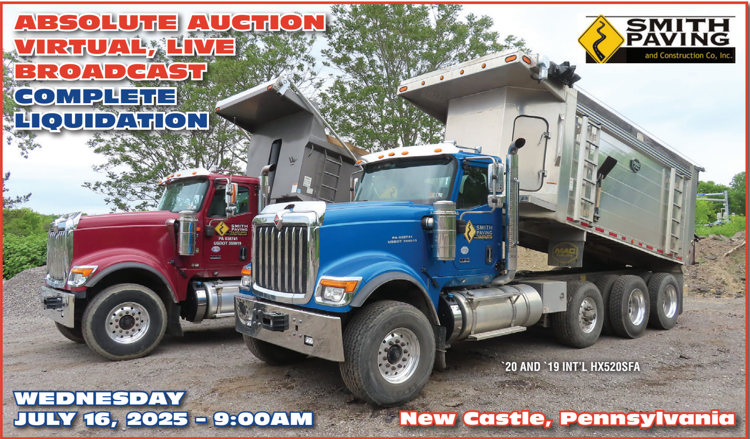
‘20 AND ‘19 INT’L HX520SFA