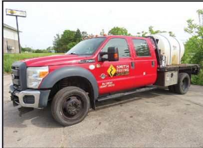
'14 FORD F550XL SD 4X4

2014 FORD Model F550XL SD 4x4 Crew Cab Flatbed Truck , powered by Powerstroke 6.7L diesel engine and automatic transmission, equipped with J&J 9' steel flatbed, Western 9' snowplow, VMAC behind cab air compressor, 525 gallon poly water tank, 2" centrifugal pump, air hose reel, dually, power windows and locks, cruise control, air conditioning, and 225/70R19.5 tires. In good condition with good tires. (Odometer Reads 114,360 Miles) (Purchased New)