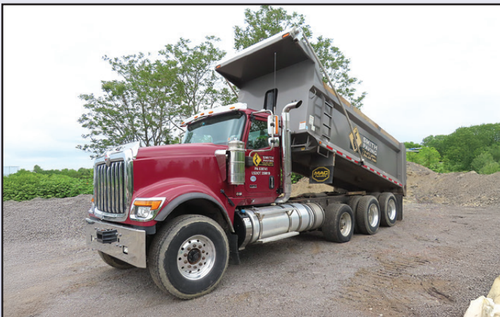
19 INT'L HX520SFA

2020 INTERNATIONAL Model HX520SFA Tri-Axle Dump Truck , powered by Cummins X15-565, 565HP diesel engine and Eaton Fuller Ultrashift Plus automatic transmission, equipped with Mac 19'6" smooth side aluminum body, sliding power tarp, 46,000 lb rear axles, 20,000 lb front axle, 20,000 lb lift axle, block/beam suspension, locking axles and differentials, engine brake, aluminum wheels, power windows, locks, and mirrors, cruise control, air conditioning, and 11R24.5 tires. In good to very good condition with good to very good tires. (Odometer Reads 123,038 Miles) (Purchased New)