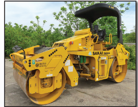
'19 SAKAI SW654

2019 SAKAI Model SW654 Tandem Vibratory Roller , s/n 1SW53-30214, powered by Kubota diesel engine and hydrostatic transmission, equipped with 58" smooth drums, 2-frequency vibration, drum selector, spray system with pause timer, and ROPS canopy. In very good condition. (Meter Reads 672 Hours) (Purchased New)