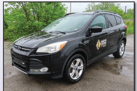
'15 FORD SE AWD SUV

2015 FORD Model Escape SE 4 Door AWD Sport Utility Vehicle , powered by 1.6L turbo gas engine and automatic transmission, equipped with full power package and 235/55R17 tires. In fair to good condition with good tires. (Odometer Reads 203,908 Miles) (Dealer Purchase - Used)