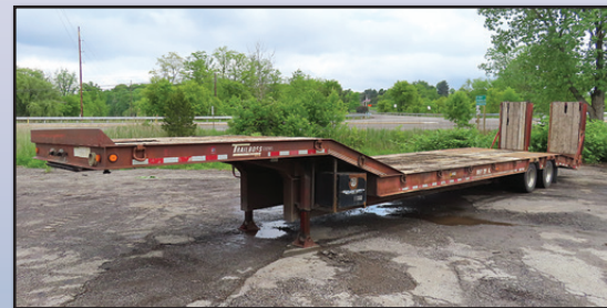
TRAILBOSS PAVER SPECIAL

TRAILBOSS Model Paver Special Tandem Axle Trailer , equipped with 25' x 102" load deck, 6' beavertail, hydraulic ramps, 9'6" upper deck, air ride suspension, aluminum wheels, and 235/75R17.5 tires.