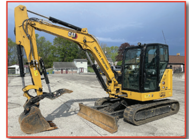
‘23 CAT 306CR

PRE-SORTED FIRST CLASS MAIL US POSTAGE PAID UPPER DARBY, PA PERMIT #45