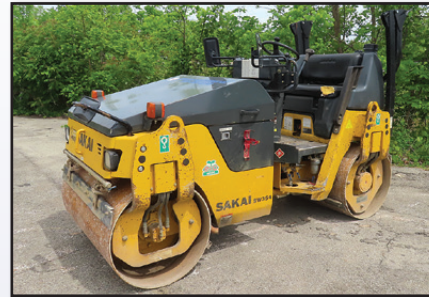
'20 SAKAI SW354

2012 CATERPILLAR Model CB14 Tandem Vibratory Roller , s/n DTT01128, powered by Cat C1.1 diesel engine and hydrostatic transmission, equipped with 31.5" smooth drums, drum vibration selector, and folding rollbar. In good condition. (Meter Reads 561 Hours) (Low Hour Dealer Purchase)