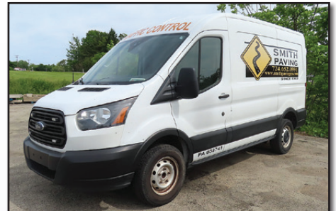
'19 FORD TRANSIT 250

2019 FORD Model Transit 250 Van , powered by gas engine and automatic transmission, equipped with strobe lights, power windows and locks, cruise control, air conditioning, and 235/65R16 tires. In good condition with good tires. (Odometer Reads 91,598 Miles) (Dealer Purchase - Used)