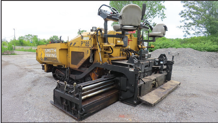
'22 WEILER 385B

2019 CATERPILLAR Model AP555F Crawler Paver , s/n AP500319, powered by Cat C4.4 diesel engine and hydraulic drive, equipped with Weiler SE8F, 8' – 15'8" electric heated screed, power slope, grade and crown, grade control equipped, and 16" smooth rubber tracks. In good condition with good tracks. (Meter Reads 2,331 Hours) (Low Hour Dealer Purchase)