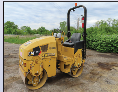
'11 CAT CB24

LEEBOY Model L250 Tack Sprayer , equipped with Predator gas engine, propane heat, folding spray bars, hose reel and wand. In good condition. (Purchased New)