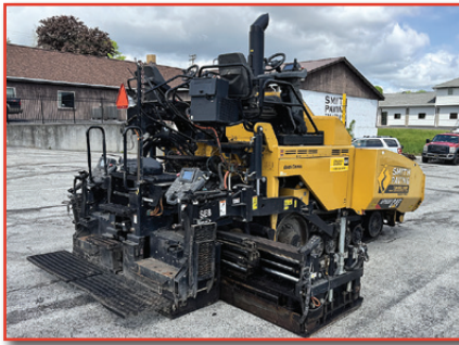
‘19 CAT AP555F

PRE-SORTED FIRST CLASS MAIL US POSTAGE PAID UPPER DARBY, PA PERMIT #45