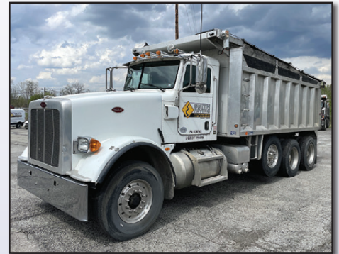
14 PETERBILT 367