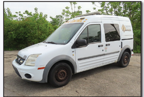
'12 FORD SLT TRANSIT CONNECT

2012 FORD Model SLT Transit Connect Van , powered by 2.0L gas engine and automatic transmission, equipped with power windows and locks, cruise control, air conditioning, and 205/65R15 tires. In fair to good condition with fair to good tires. (Odometer Reads 125,443 Miles) (Dealer Purchase - Used)