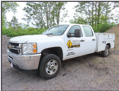
'14 CHEVY 2500HD

2014 CHEVROLET Model 2500HD Crew Cab Utility Truck , powered by Vortec 6.0L gas engine and automatic transmission, equipped with Knapheide 8' open utility body, 100 gallon fuel tank with 12 volt pump, power windows and locks, cruise control, air conditioning, and 245/75R17 tires. In good condition with fair to good tires. (Odometer Reads 191,417 Miles) (Purchased New)