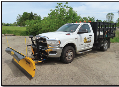
'21 RAM 3500HD 4X4

2021 RAM Model 3500HD 4x4 Stake Body Truck , powered by Hemi 6.4L gas engine and automatic transmission, equipped with 9' stake body, under body toolboxes, Meyer 8.5' snowplow with EZ mount, Snow-Way electric spreader, hitch mount, single rear wheels, full power package, and 275/70R18 tires. In good to very good condition with good tires. (Odometer Reads 49,619 Miles) (Purchased New)