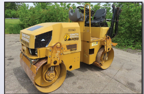
'12 CAT CB14

2012 CATERPILLAR Model CB14 Tandem Vibratory Roller , s/n DTT01128, powered by Cat C1.1 diesel engine and hydrostatic transmission, equipped with 31.5" smooth drums, drum vibration selector, and folding rollbar. In good condition. (Meter Reads 561 Hours) (Low Hour Dealer Purchase)