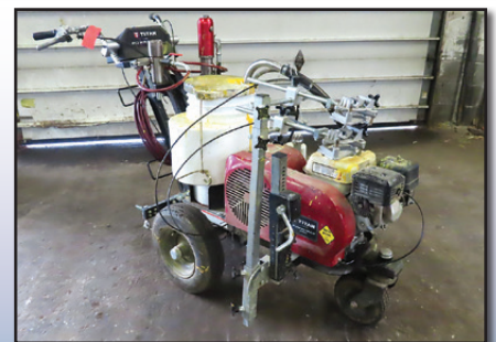
22 TITAN DUAL HEAD STRIPER

2022 TITAN Powerliner 8955 Dual Head Sprayer Line Striper, Honda gas • GRACO Line Lazer 3400 Single Sprayer, gas • HUSQUARNA FS524 Concrete Saw 24" Blade • HUSQUARNA FS513 Concrete Saw 18" Blade • (4) HUSQUARNA FS413 Walk Behind Concrete Saws • (2) Mikasa Plate compactors • WACKER Foot Compactor • (2) STIHL Back Pack Blowers • TROYBILT Storm 3090 2-Stage Snow Blower • (2) 275-Gallon Oil Tanks with Pneumatic Pumps and Hose Reels • GARDNER DENVER Vertical Shop Air Compressor, 7.5 HP, 208-230 Volt Single Phase • MILLERMATIC 212 Auto-Set Mig Welder • Oxygen/Acetylene Torch Set • HOTSY Electric Steam Cleaner • Horizontal Metal Cutting Band Saw • NATIONAL 20-Ton Shop Press • Rolling Tool Chest • DAYTONA 2-Ton Floor Jack • PITTSBURGH 22-Ton Pneumatic Bottle Jack • Fabric Road Signs • (1) Pallet Ice Melter