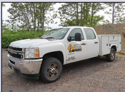
'14 CHEVY 2500HD

2014 CHEVROLET Model 2500HD Crew Cab Utility Truck , powered by Vortec 6.0L gas engine and automatic transmission, equipped with Knapheide 8' open utility body, 100 gallon fuel tank with 12 volt pump, power windows and locks, cruise control, air conditioning, and 245/75R17 tires. In good condition with good tires. (Odometer Reads 131,462 Miles) (Purchased New)