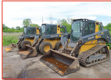
‘22 JD 333G AND (2) 328D’S

1440 COWPATH RD. • HATFIELD, PA 19440 215/361-9099 • Fax: 215/361-9212 www.hunyady.com