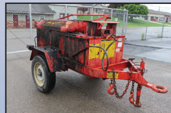
PORTABLE TAR KETTLE

LEEBOY Model L250 Tack Sprayer , equipped with Predator gas engine, propane heat, folding spray bars, hose reel and wand. In good condition. (Purchased New)