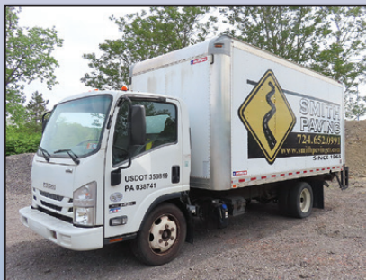
'18 ISUZU NQR

2018 ISUZU Model NQR Cab Over Straight Truck , powered by diesel engine and automatic transmission, equipped with Morgan 16' smooth side aluminum body with 2,500 lb electric lift gate, dual rear wheels, and 225/70R19.5 tires. In good condition with good tires. (Odometer Reads 77,573 Miles) (Purchased New)