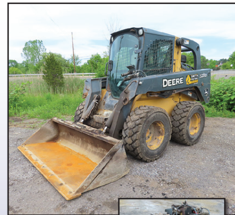
'12 JOHN DEERE 328D

Skid Steer Attachments: JOHN DEERE Model CP30C 30" Milling Attachment, s/n 000020 • KENT Model F4 Hydraulic Demo Hammer • SWEEPSTER Model 7' Hydraulic Broom with Power Angle • BLUE DIAMOND Model 6' Hydraulic Broom with Power Angle • JOHN DEERE Model DB96 8' 6-Way Dozer Blade, s/n 896 • 48" Fork Attachment