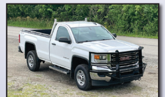
'15 GMC 2500HD, 4X4

2015 GMC Model 2500HD Sierra, 4x4 Pickup Truck , powered by Vortec 6.0L gas engine and automatic transmission, equipped with 8' bed with spray on liner, aluminum side rails and rear window guard, tow package, running boards, brush guard, power locks, cruise control, air conditioning, and 245/75R17 tires. In good condition with good tires. (Odometer Reads 62,061 Miles) (PA Inspection thru 3/26)