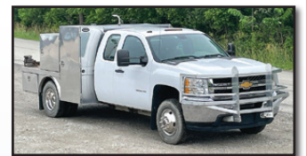
'13 CHEVY 3500HD, 4X4

2013 CHEVROLET Model 3500HD, 4x4 Quad Cab Welder Truck , powered by Vortec 6.0L gas engine and automatic transmission, equipped with Martin 9' aluminum welder body, Lincoln SAE300 diesel powered welder/generator (2,451 hours) with remote control, oxygen acetylene reels, welding lead reels, torches, beveling machine, vise, tow package, dual rear wheels, aluminum brush guard, power locks, cruise control, air conditioning, and 235/80R17 tires. In good condition with good tires. (Odometer Reads 58,211 Miles) (Purchased New) (PA Inspection thru 3/26) 1981 INTERNATIONAL Model 1724 Single Axle Welder Truck , powered by V-8 gas engine and 4 speed transmission with 2 speed rear, equipped with 10'6" welder body, Lincoln SA200, 200 amp gas powered welder/generator, s/n A964163, vise, 10R22.5 front and 8.25x20 rear tires. In fair to good condition with good tires. (Odometer Reads 068,191 Miles) (Purchased New) (PA Inspection thru 5/26)