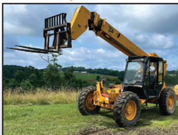
05 JCB 506C, 6,000#

2005 JCB Model 506C, 6,000# Telescopic Rough Terrain Forklift , s/n SLP506C05E0588014, powered by Perkins 4 cylinder diesel engine and shuttle transmission, equipped with 42' lift height, 3-section hydraulic boom, 48" forks, auxiliary hydraulics, 4-wheel steer, enclosed ROPS cab with heat, and 13.00x24 tires. In good condition with good tires. (Meter Reads 3,552 Hours)