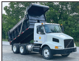
'02 VOLVO VNM64

2002 VOLVO Model VNM64 Tandem Axle Dump Truck , powered by Volvo VED12-345, 345HP diesel engine and Meritor 10 speed transmission, equipped with Godwin 13' steel dump body with 2-way gate with chute and electric tarp, engine brake, 38,000# rears, 12,000# front axle, 50,000# GVWR, air ride suspension, tow package with air, air conditioning, 295/75R22.5 front and 275/80R22.5 rear tires. In good condition with good tires. (Odometer Reads 372,227 Miles) (PA Inspection thru 4/26)