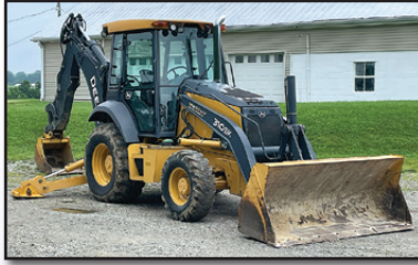
14 JOHN DEERE 310SK, 4X4 EXTEND-A-HOE

2014 JOHN DEERE Model 310SK, 4x4 Tractor Loader Extend-A-Hoe , s/n 266510, powered by JD diesel engine and powershift transmission, equipped with general purpose loader bucket with bolt-on cutting edge, 24" digging bucket with bolt-on straight edge, John Deere front hydraulic coupler and manual rear coupler, rear auxiliary hydraulics, ride control, enclosed ROPS cab with heat and air conditioning, 12.5/80-18 front and 19.5Lx24 rear tires. In good condition with fair tires. (Meter Reads 2,788 Hours) (Purchased New)