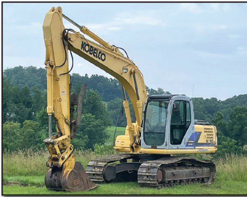
'06 KOBELCO SK160LC

2006 KOBELCO Model SK160LC Hydraulic Excavator , s/n YM03-U1405, powered by Isuzu 4 cylinder diesel engine and hydraulic drive, equipped with 10' dipper stick with auxiliary hydraulics, JRB hydraulic coupler, WB 36" digging bucket, Geith 24" hydraulic thumb, pattern changer, enclosed ROPS cab with heat and air conditioning, and 25.5" SBG pads. In good condition with good undercarriage. (Meter Reads 4,220 Hours) (Purchased New)