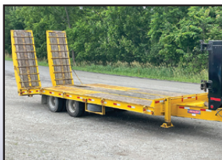
'08 PITTS 20 TON

2008 PITTS Model TA20, 20 Ton Tandem Axle Tag-A-Long • 2001 TRAIL KING Model TK40LP-2400, 20 Ton Tandem Axle Tag-A-Long • 1978 EAGER BEAVER Model 18HA Tandem Axle Tag-A-Long • 2013 RICE Tandem Axle Tilt Deck Tag-A-Long • 2006 IMPERIAL Tandem Axle Tilt Deck Tag-A-Long • 2013 PREMIER Tandem Axle Tag-A-Long • 2009 TOP BRAND Single Axle Tag-A-Long • 2006 TOP BRAND Single Axle Tag-A-Long • 1998 GREAT DANE 45' Tandem Axle Van Storage • 1997 GREAT DANE 45' Tandem Axle Office/Storage