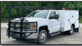
'18 CHEVY 3500HD, 4X4

2018 CHEVROLET Model 3500HD, 4x4 Utility Truck , powered by Duramax 6.6L diesel engine and Allison automatic transmission, equipped with Knapheide 9' open utility body with spray-on liner, Tommy Gate electric lift gate, material rack, tow package, dual fuel tanks, dual rear wheels, running boards, power windows, locks, and mirrors, cruise control, air conditioning, and 235/80R17 tires. In good condition with good tires. (Odometer Reads 89,416 Miles) ( Purchased New ) (PA Inspection thru 4/26)