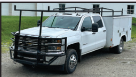
'15 CHEVY 3500HD, 4X4

2015 CHEVROLET Model 3500HD, 4x4 Crew Cab Utility Truck , powered by Duramax 6.6L diesel engine and Allison automatic transmission, equipped with Reading 9' open utility body with spray-on liner, 100 gallon fuel tank with electric pump, material rack, tow package, dual fuel tanks, dual rear wheels, power windows, locks, and mirrors, cruise control, air conditioning, and 235/80R17 tires. In good condition with good tires. (Odometer Reads 103,833 Miles) ( Purchased New ) (PA Inspection thru 4/26)