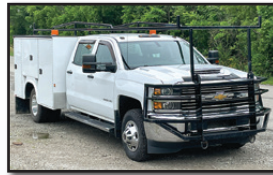
'18 CHEVY 3500HD SILVERADO, 4X4

2018 CHEVROLET Model 3500HD Silverado 4x4 Crew Cab Utility Truck , powered by Duramax 6.6L diesel engine and Allison automatic transmission, equipped with Knapheide 9' open utility body with spray-on liner, 100 gallon fuel tank with electric pump, material rack tow package, dual fuel tanks, dual rear wheels, running boards, power windows, locks, and mirrors, cruise control, air conditioning, and 235/80R17 tires. In good condition with good tires. (Odometer Reads 62,715 Miles) ( Purchased New ) (PA Inspection thru 3/26)