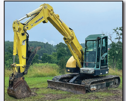
'07 YANMAR B7-5A

2007 YANMAR Model B7-5A Mini Hydraulic Excavator , s/n 58371B, powered by Yanmar 4 cylinder diesel engine and hydraulic drive, equipped with 5'7" dipper stick with auxiliary hydraulics, articulated boom, WB manual coupler, Hensley 24" digging bucket with bolt-on straight edge, Tag 17" hydraulic thumb, 89" backfill blade, pattern changer, enclosed ROPS cab with heat and air conditioning, and 17.5" rubber tracks. In good condition with very good tracks. (Meter Reads 07,672 Hours) (Purchased New)