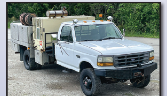
'92 FORD F-350, 4X4

1992 FORD Model F-350, 4x4 Compressor Truck , powered by Int'l 7.3L diesel engine and automatic transmission, equipped with RC 11' diamond plate aluminum utility body with side boxes, 1997 Ingersoll Rand P185WJDU air compressor, s/n 273903UCH296, powered by JD diesel engine (0,896 Hours), Ramsey front bumper winch, behind cab material basket, tow package, dual rear wheels, and 235/85R16 tires. In good condition with good tires. (Odometer Reads 126,117 Miles) (PA Inspection thru 3/26) 1995 INTERNATIONAL Model 4700 Compressor Truck , powered by Int'l DT466 diesel engine and 5 speed transmission with 2 speed rear, equipped with Stahl 9' walk-in utility body, Vanair model 125UDEC air compressor, s/n 30-55964, tow package, heated mirrors, and 9R22.5 tires. In good condition with good tires. (Odometer Reads 082,628 Miles) (PA Inspection thru 4/26)