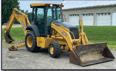
03 JOHN DEERE 310G, 4X4

2003 JOHN DEERE Model 310G, 4x4 Tractor Loader Backhoe , s/n 912375, powered by JD diesel engine and shuttle transmission, equipped with general purpose loader bucket, WB 12" digging bucket, rear auxiliary hydraulics, enclosed ROPS cab with heat and air conditioning, 12x16.5 front and 19.5Lx24 rear tires. In good condition with good to very good tires. (Meter Reads 5,191 Hours) (Purchased New)