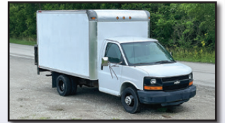
'06 CHEVY SINGLE AXLE

2006 CHEVROLET Single Axle Van Body Truck , powered by 6.0L gas engine and automatic transmission, equipped with Supreme 12' aluminum van body with Tommy Gate electric lift gate, rollup rear door, dual rear wheels, air conditioning, and 225/75R16 tires. In good condition with good tires. (Odometer Reads 54,472 Miles) (PA Inspection thru 4/26)