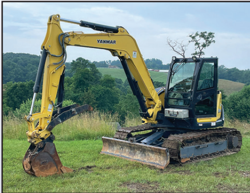
'16 YANMAR SV100-2A

2016 YANMAR Model SV100-2A Hydraulic Excavator , s/n 21223, powered by Yanmar diesel engine and hydraulic drive, equipped with 7' dipper stick with auxiliary hydraulics, hydraulic coupler, Tag 18" digging bucket with bolt-on straight edge, Tag 17" hydraulic thumb, 91" backfill blade, pattern changer, enclosed ROPS cab with heat and air conditioning, and 19" SBG pads. In good condition with good undercarriage. (Meter Reads 2,601 Hours) (Purchased New)