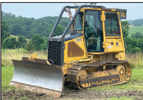
'04 JOHN DEERE 650H LT

1974 CATERPILLAR Model D7F Crawler Tractor , s/n 94N8258, powered by Cat 3306 diesel engine and powershift transmission, equipped with C-frame manual angle straight blade with dual tilt, Hyster rear winch with draw bar, ROPS canopy, and 24" SBG pads. In fair condition with fair undercarriage. (Low Hours on Rods and Mains, and Water Pump)