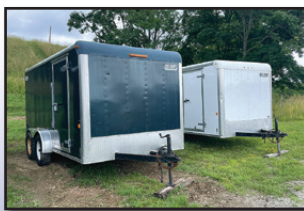
CARMATE CARGO TRAILERS

2014 CARMATE Model CM714EC-HD, 7' x 14' Tandem Axle Cargo Trailer • 2009 CARMATE Model CM714CC-HD, 7' x 14' Tandem Axle Cargo Trailer • 2002 TIMBERWOLF 8' x 20'6" Tandem Axle Cargo Trailer • 1992 BURKETS Model BD.7 Tandem Axle Dump Trailer • 2016 Shop Made 38' Tandem Axle Pipe Trailer