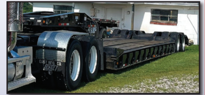
'97 TRAIL KING 40 TON

1997 TRAIL KING 40 Ton Tandem Axle Lowboy Trailer , equipped with non ground bearing detachable gooseneck, 22' level deck, 6' open over axles, 31" beavertail, 8'6" width, air ride suspension, aluminum wheels, chain dogs, outriggers, and 255/70R22.5 tires. In good condition with good tires. (Purchased New) 2006 FONTAINE Model FTW-5-8045SL, 45' Tandem Axle Flatbed Trailer , equipped with 96" width, spring suspension, 80,000# GVWR, ratchet straps, sliding tandems, aluminum wheels, and 295/75R22.5 tires. In good condition with good tires. 40' Tandem Axle Flatbed Trailer , equipped with 96" width, spring suspension, ratchet straps, aluminum wheels, and 11R22.5 tires. In good condition with good tires.