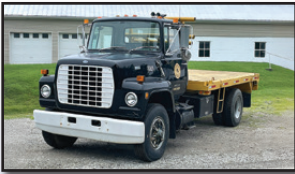
'83 FORD 8000

1983 FORD Model 8000 Single Axle Winch Truck , powered by Cat 3208, 210HP diesel engine and 5 speed transmission with 2 speed rear, equipped with Leland 14'10" steel bed with fold away A-frame and Tulsa mechanical winch, rolling tail, spring suspension, air brakes, and 11R22.5 tires. In good condition with good tires. (PA Inspection thru 5/26)