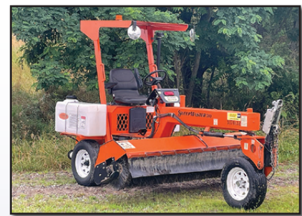
17 LAYMOR SM300

2017 LAYMOR Model SM300 Self Propelled Broom , s/n 38046, powered by Kubota 3 cylinder diesel engine and hydrostatic transmission, equipped with 92" hydraulic angle broom, (2) poly water tanks, tow package, ROPS post with canopy, and 205/75R14 tires. In very good condition with very good tires. (Meter Reads 00,101 Hours)