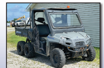
(1) OF (3) POLARIS 6X6 ATV'S

2008 POLARIS Model 700 Ranger, 6x6 ATV , powered by 2 cylinder gas engine and hi-lo transmission, equipped with roll bar with roof and windshield, 4' electric dump bed, bumper winch, 25x10x12 front and 26x11.00x12 rear tires. In good condition with good tires.