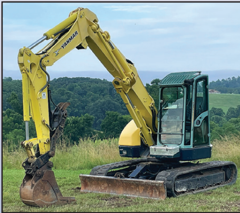
'06 YANMAR B7-5A

2006 YANMAR Model B7-5A Mini Hydraulic Excavator , s/n 58083B, powered by Yanmar 4 cylinder diesel engine and hydraulic drive, equipped with 5'7" dipper stick with auxiliary hydraulics, articulated boom, WB manual coupler, Tag 18" digging bucket with bolt-on straight edge, WB 17" hydraulic thumb, 89" backfill blade, pattern changer, enclosed ROPS cab with heat and air conditioning, and 17.5" rubber tracks. In good condition with fair to good tracks. (Meter Reads 05,327 Hours) (Purchased New)