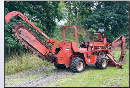
DITCH WITCH 6510DD, 4X4

1990 DITCH WITCH Model 6510DD 4x4 Combination Trencher/Backhoe , s/n 6G1801, powered by Deutz 4 cylinder diesel engine and 4 speed transmission, equipped with model A420 backhoe attachment, with 12" bucket, model A615, 7' trencher with crumbler, 72" backfill blade, ROPS post, and 31x50x15 tires. In good condition with good tires.