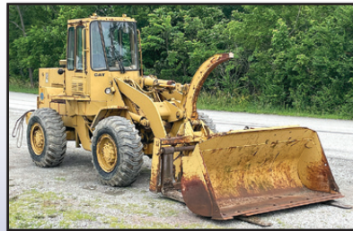
85 CAT 926

1985 CATERPILLAR Model 936 Rubber Tired Side Boom Loader , s/n 33Z01365, powered by Cat 4 cylinder diesel engine and powershift transmission, equipped with Midwest hydraulic side boom with Ramsey winch, hydraulic left side dump bucket, enclosed ROPS cab, and 20.5x25 tires. In fair condition with fair tires.