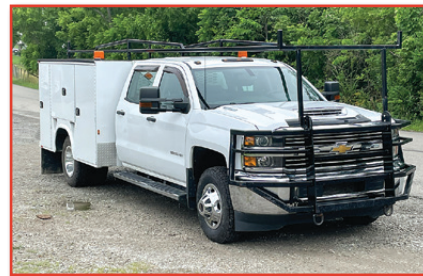
'18 CHEVY 3500HD SILVERADO, 4X4

PRE-SORTED FIRST CLASS MAIL US POSTAGE PAID UPPER DARBY, PA PERMIT #45