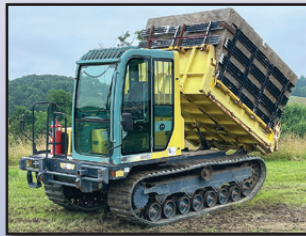
08 YANMAR C50R-3B

2008 YANMAR Model C50R-3B Crawler Dumper , s/n 45596C, powered by Yanmar 4 cylinder diesel engine and hydraulic drive, equipped with 8'6" bed with fold-down sides, 42" stake sides, enclosed ROPS cab, and 18" rubber tracks. In good condition with good tracks. (Meter Reads 1,247 Hours) (Purchased New)