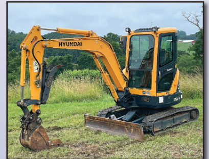
'12 HYUNDAI 35Z-9

2012 HYUNDAI Model 35Z-9 Robex Mini Hydraulic Excavator , s/n 0000188, powered by Yanmar 3 cylinder diesel engine and hydraulic drive, equipped with 4'3" dipper stick with auxiliary hydraulics, WB manual coupler, CP 17" digging bucket with bolt-on straight edge, swing boom, Amulet 10" hydraulic thumb, 69" backfill blade, pattern changer, enclosed ROPS cab with heat and air conditioning, and 12" rubber tracks. In good condition with good tracks. (Meter Reads 1,948 Hours) (Purchased New)