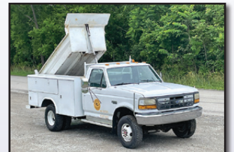
'93 FORD F-350XL, 4X4

1993 FORD Model F-350XL, 4x4 Utility/Dump Truck , powered by V-8 gas engine and automatic transmission, equipped with Reading 9' open utility body, steel dump body insert, tow package, dual rear wheels, running boards, and 235/85R16 tires. In good condition with good tires. (PA Inspection thru 4/26)