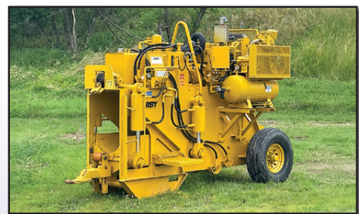
08 DARBY HPB6-20

2008 DARBY Model HPB6-20, 6" - 20" Tow Behind Pipe Bender , s/n 10853, powered by Cat 3054C diesel engine, equipped with Quincy 2-stage hydraulic air compressor and 11.00x16 tires. In good condition with good tires. (Meter Reads 00,625 Hours) (Purchased New)