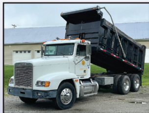
'98 FREIGHTLINER TANDEM AXLE

1998 FREIGHTLINER Tandem Axle Dump Truck , powered by Cummins N14 Plus diesel engine and Rockwell 10 speed transmission, equipped with Godwin 16' steel dump body with 2-way gate with chute and electric tarp, 3-stage engine brake, 40,000# rears, 13,220# front axle, 53,220# GVWR, aluminum wheels, tow package with air, power heated mirrors, cruise control, air conditioning, 11R22.5 front and 295/75R22.5 rear tires. In good condition with good tires. (PA Inspection thru 4/26)