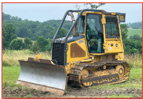
'04 JOHN DEERE 650H LT

PRE-SORTED FIRST CLASS MAIL US POSTAGE PAID UPPER DARBY, PA PERMIT #45