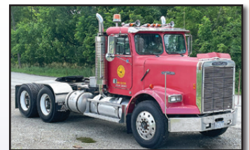
'88 FREIGHTLINER TANDEM AXLE

1988 FREIGHTLINER Tandem Axle Truck Tractor , powered by Cat 6 cylinder diesel engine and Fuller 8LL, 10 speed transmission, equipped with wetline, stationary 5th wheel, spring/beam suspension, double frame, 2-stage engine brake, aluminum headache rack, aluminum front wheels, heated mirrors, power passenger mirror, air conditioning, and 11R24.5 tires. In good condition with good tires. (New Rear Brakes and Drums) (PA Inspection thru 4/26)