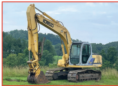
'06 KOBELCO SK160LC

1440 COWPATH RD. • HATFIELD, PA 19440 215/361-9099 • Fax: 215/361-9212 www.hunyady.com