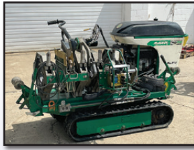
'01 MCELROY TRACSTAR 412

(2) MCELROY 1/2" - 1" Fusion Machines , with accessories • MCELROY Hand Held Fusion Machines • (2) GENESIS F3 Electronic Fusion Machines • FRIATEC Electric Fusion Machine • Plastic Pipe Shaver • KEROTEST PortaFuse II Cordless Fusion Machine • (2) FOOTAGE 12" Aluminum Hydraulic Squeeze Off Tools , with (1) PowerTeam air over hydraulic pump • (4) FOOTAGE 2" - 8" Hydraulic Squeeze Off Tools • (6) 2" - 8" Hydraulic Squeeze Clamps • FRIATEC 8" Scraper Unit • (2) GF 8" Rotary Peelers • (1) 26", (1) 20", and (1) 16" Manual Bevelers • (3) 8" - 14" Manual Bevelers • (5) 4" - 8" Manual Bevelers • (3) 2" - 4" Manual Bevelers • 16" - 20" Band Bevelers • RIDGID 700 Threader , with accessories • RIDGID 300 Pipe Threader , with accessories • (10) 20" Pipe Rollers • (25) Assorted Pipe Cutters • RIDGID Hitch Mount Pipe Clamp • (11) 2" to 5" Pneumatic Underground Piercing Tools • (1) METROTECH and (2) SPY Pipe Locators • MAGNUM • 1.5" Pneumatic Torque Wrench System • LARGE QUANTITY Pipe Lifting and Welding Clamps • Cable Spreaders and Slings • LARGE QUANTITY Pipe Stands