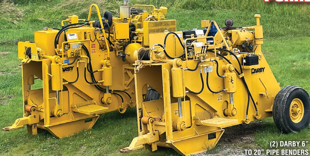
(2) DARBY 6" TO 20" PIPE BENDERS

WEDNESDAY, AUGUST 13, 2025 9:00AM Claysville, Pennsylvania