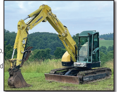
'07 YANMAR B7-5A

2007 YANMAR Model B7-5A Mini Hydraulic Excavator , s/n 58352B, powered by Yanmar 4 cylinder diesel engine and hydraulic drive, equipped with 5'7" dipper stick with auxiliary hydraulics, articulated boom, WB manual coupler, WB 18" digging bucket, WB 17" hydraulic thumb, 89" backfill blade, pattern changer, enclosed ROPS cab with heat and air conditioning, and 13" SBG pads. In good condition with good undercarriage. (Meter Reads 07,110 Hours)