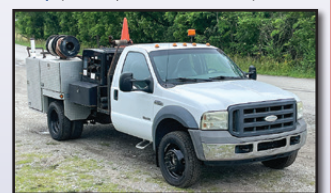
'05 FORD F-450XL SD, 4X4

2005 FORD Model F-450XL Super Duty, 4x4 Compressor Truck , powered by Power Stroke 7.3L diesel engine and automatic transmission, equipped with RC 11' diamond plate aluminum utility body, Airmann air compressor, powered by Isuzu diesel engine (2,459 hours), self winding air hose reels, dual rear wheels, tow package, cruise control, air conditioning, and 225/70R19.5 tires. In good condition with good tires. (Odometer Reads 122,516 Miles) (PA Inspection thru 4/26)