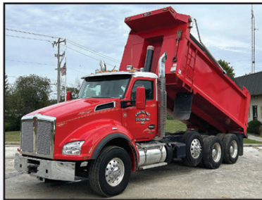
'23 KENWORTH T-880

2023 KENWORTH Model T-880 Tri-Axle Dump Truck , powered by Paccar MX13, 483HP diesel engine and Eaton Fuller 8LL, 10 speed transmission, equipped with Air-Flo 17' steel dump body, power tarp, 46,000 lb rears, 20,000 lb front axle, 13,200 lb steerable lift axle, full locking differentials, air ride suspension, aluminum wheels, power windows and locks, cruise control, air conditioning, and 215/80R22.5 tires. In very good condition with very good tires. (Odometer Reads 30,896 Miles) (Meter Reads 1,828 Hours) (Purchased New)