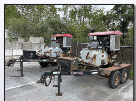
'06 AND '05 ASPHALT ZIPPERS