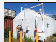
10,000 GALLON FUEL TANK

HOTSY Model 1453P Pressure Washer, 3,000 psi/4 GPM, 378,000 BTU burner, 240 volt • (2) 275 Gallon Lube Tanks, with pneumatic pumps, hose reels and metered guns • Waste Oil Tank • MILLERMATIC 212 Auto Set MIG Welder • MILLERMATIC 211 Auto Set MIG Welder • (3) MILLER S-32P Wire Feeder • MILLER 330 Arc Welder • Steel Stock and Rack: Flat