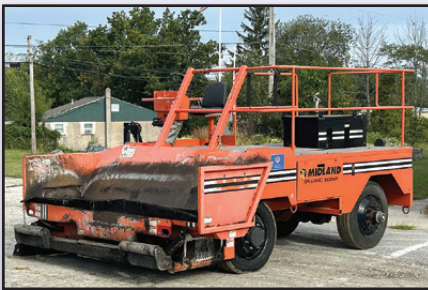
'20 MIDLAND SPR-6