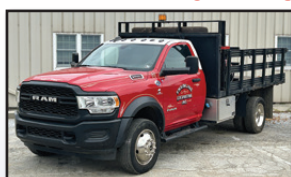
22 RAM 5500HD, 4X4

2022 RAM Model 5500HD, 4x4 Stake Body Truck , powered by Cummins 6.7L Turbo, 143HP diesel engine and automatic transmission, equipped with 12' stake body, 100 gallon fuel tank, 65 gallon poly water tank, dual rear wheels, tow package, under body toolboxes, 19,500 lb GVWR, power windows and locks, cruise control, air conditioning, and 225/70R19.5 tires. In very good condition with good tires. (Odometer Reads 19,914 Miles) (Purchased New)