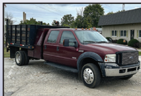
06 FORD F-550XLT

2006 FORD Model F-550XLT Crew Cab Stake Body Truck , powered by Powerstroke 6.0L diesel engine and automatic transmission, equipped with 9'8" stake body with lift gate, behind cab toolboxes, 100 gallon fuel tank with 12 volt pump, aluminum wheels, dual rear wheels, tow package, power windows and locks, air conditioning, and 225/70R19.5 tires. In good condition with good tires. (Odometer Reads 140,969 Miles) (New Engine Installed @ 119,963 Miles)