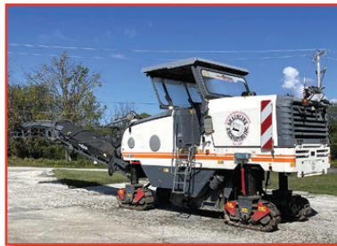
'11 WIRTGEN W150 (2,583 HOURS)

1440 COWPATH RD. • HATFIELD, PA 19440 215/361-9099 • Fax: 215/361-9212 www.hunyady.com