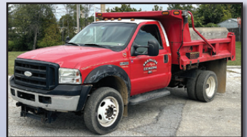
'05 FORD F-550XL, SD 4X4

2005 FORD Model F-550XL Super Duty, 4x4 Single Axle Dump Truck , powered by Powerstroke 6.0L diesel engine and automatic transmission, equipped with 9' dump body with electric hoist, power tarp, plow setup, dual rear wheels, and 225/70R19.5 tires. In good condition with fair tires. (Odometer Reads 181,941 Miles) (Meter Reads 2,670 Hours)