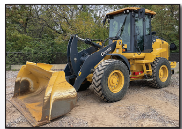
21 JOHN DEERE 444P

2021 JOHN DEERE Model 444P Rubber Tired Loader , s/n 12816, powered by JD diesel engine and powershift transmission, equipped with hydraulic coupler, front auxiliary hydraulics, general purpose loader bucket, auto differential lock, ride control, power and heated mirrors, heated and ventilated seat, enclosed ROPS cab with air conditioning, and 17.5R25 tires. In very good condition with very good tires. (Meter Reads 701 Hours) (Purchased New)