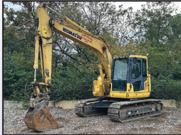
11 KOMATSU PC138USLC-8

2011 KOMATSU Model PC138USLC-8 Hydraulic Excavator , s/n 26401, powered by Komatsu ECOT3 diesel engine and hydraulic drive, equipped with 8' dipper stick, JRB hydraulic coupler, auxiliary hydraulics, Strickland 24" digging bucket with side cutters, rear camera, enclosed ROPS cab with air conditioning, and 20" street pads. In good condition with good undercarriage. (Meter Reads 6,867 Hours) (Purchased New)