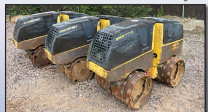
BOMAG BMP8500 TRENCH COMPACTORS

2013 BOMAG Model BMP8500 Articulated Trench Compactor , s/n 101720121702, powered by Kubota diesel engine, equipped with 24" padfoot drums and umbilical remote. In good condition. (Meter Reads 1,645 Hours)