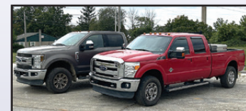
18 FORD F-250, 4X4 AND 15 FORD F-350, 4X4

2018 FORD Model F-250XLT, 4x4 Crew Cab Pickup Truck , powered by 6.2L gas engine and automatic transmission, equipped with 6'8" bed, FX4 off road package, sunroof, full power package, alloy wheels, and 275/70R18 tires. In good condition with good tires. (Odometer Reads 102,528 Miles) (Purchased New)