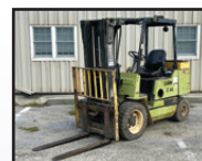
CLARK 5,000 LB

CLARK Model GPS30MC, 5,000 Lb Cushion Tired Forklift , s/n GP138MC-0046-6482FA, powered by 4 cylinder gas engine and shuttle transmission, equipped with 188" 3-stage mast, 42" forks, side shift, and FOPS canopy. In good condition with good tires. (Meter Reads 5,452)