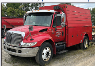
06 INTERNATIONAL 4300

2006 INTERNATIONAL Model 4300 Utility Truck , powered by Int'l DT466 diesel engine and automatic transmission, equipped with Reading 12' walk-in utility body, Vanair PTO air compressor, rear air outlets (jackhammer capable), 1,000 watt power inverter, traffic signal bars, locking differentials, air brakes, dual rear wheels, 25,500 lb GVWR, cruise control, air conditioning, and 10R22.5 tires. In good condition with good tires. (Odometer Reads 175,166 Miles) (Meter Reads 1,777 Hours) (NEW Automatic Transmission) (Purchased New)