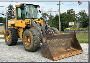
97 VOLVO L70C

JRB Side Dump Bucket , left-side dump, 1.75 cubic yard. In very good condition. (JD 444P) • JRB 60" Fork Attachment (JD 444P) • VOLVO 57" Fork Attachment (Volvo L70/L45) • VOLVO 48" Fork Attachment (Volvo L70/L45)