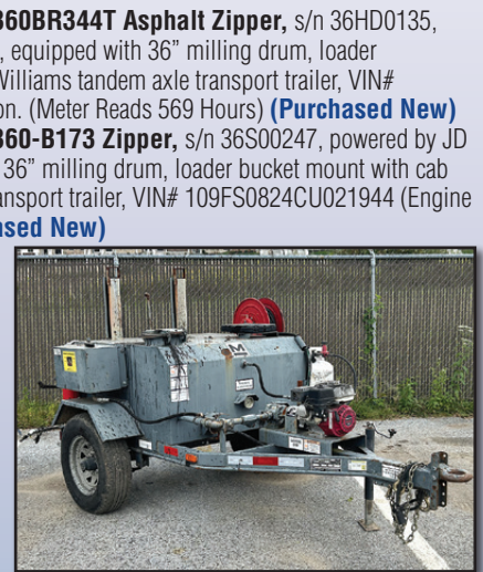
'20 MARATHON TACK COAT MACHINE