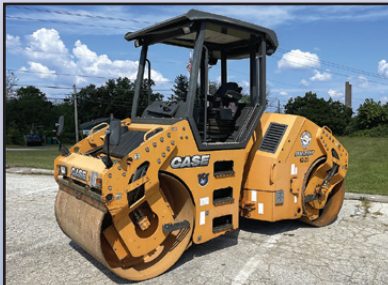
'13 CASE DV207

2016 BOMAG Model BW900-50 Tandem Vibratory Roller , s/n 861834072050, powered by Honda V-twin gas engine and hydrostatic transmission, equipped with 35" smooth drums and rollbar. In good condition. (Meter Reads 95 Hours) (Purchased New)