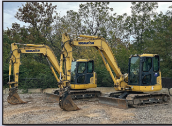
(2) 15 KOMATSU PC88MR-10

2015 KOMATSU Model PC88MR-10 Hydraulic Excavator , s/n 7338, powered by Komatsu diesel engine and hydraulic drive, equipped with 7' dipper stick, JRB hydraulic coupler, auxiliary hydraulics, WB 24" digging bucket, swing boom, 92" backfill blade, rear camera, enclosed ROPS cab with air conditioning, and 18" street pads. In good condition with good undercarriage. (Meter Reads 670 Hours – Not Accurate) (Purchased New)