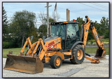
12 CASE 580SN, 4X4 EXTEND-A-HOE

2012 CASE Model 580SN, 4x4 Tractor Loader Extend-A-Hoe , s/n 565180, powered by Case diesel engine and powershift transmission, equipped with general purpose loader bucket, 24" digging bucket, 4-stick backhoe controls, rear manual coupler, rear auxiliary hydraulics, ride control, enclosed ROPS cab with air conditioning, 12x16.5 front and 19.5L24 rear tires. In good condition with fair to good tires. (Meter Reads 6,939 Hours) (Has Title) (Purchased New)