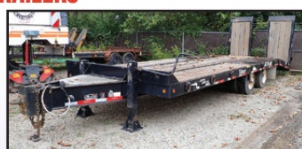
16 TALBERT 20 TON

2016 TALBERT Model AC-20-AR, 20 Ton Tandem Axle Tag-A-Long Trailer , equipped with 21' x 102" deck with beavertail and air assisted hydraulic ramps, air brakes, spring suspension, and 215/75R17.5 tires. In good condition with good tires. ( Purchased New )