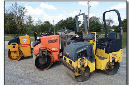
(3) TANDEM VIBRATORY ROLLERS

(2) DITCH RUNNER Model DR150 Utility Paving Attachments , equipped with 24" – 48" paving width, 2.5" – 8.5" paving depth, loader bucket mount.