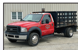
06 FORD F-550XL

2006 FORD Model F-550XL Super Duty Stake Body Truck , powered by Powerstroke 6.0L diesel engine and automatic transmission, equipped with 10' stake body, dual rear wheels, tow package, cruise control, air conditioning, and 225/70R19.5 tires. In fair to good condition with fair to good tires. (Odometer Reads 170,704 Miles) (Bad Head Gasket)