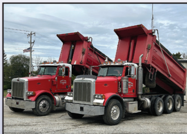
'06 PETERBILT 379 AND '06 PETERBILT 357

2006 PETERBILT Model 379 Tri-Axle Dump Truck , powered by Cat C15 diesel engine and Eaton Fuller 8LL, 10 speed transmission, equipped with Beau Roc 17'6" steel dump body, power tarp, 46,000 lb rears, 20,000 lb front axle, 20,000 lb lift axle, central hydraulics, full locking differentials, engine brake, Air Trac air ride suspension, aluminum wheels, heated mirrors, power windows, cruise control, air conditioning, 315/80R22.5 front, 11R24.5 rear, and 10R22.5 lift tires. In good condition with fair tires. (Odometer Reads 305,265 Miles) (Meter Reads 18,982 Hours) (Purchased New)