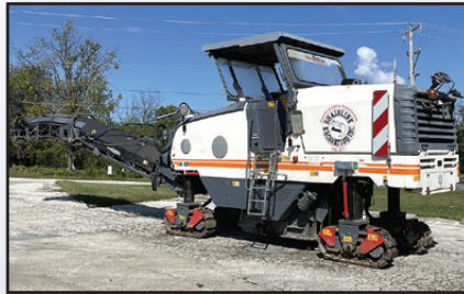
'11 WIRTGEN W150