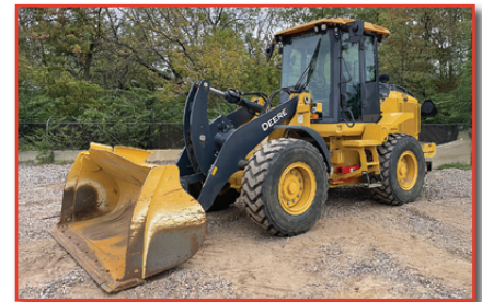
'21 JOHN DEERE 444P (701 HOURS)