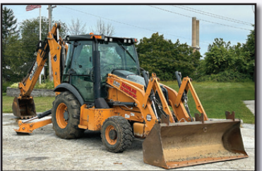
16 CASE 580SN, 4X4 EXTEND-A-HOE

2016 CASE Model 580SN, 4x4 Tractor Loader Extend-A-Hoe , s/n 721116, powered by Case diesel engine and shuttle transmission, equipped with general purpose loader bucket, 24" digging bucket, 4-stick backhoe controls, rear manual coupler, rear auxiliary hydraulics, ride control, enclosed ROPS cab with air conditioning, 12x16.5 front and 19.5L24 rear tires. In good condition with fair tires. (Meter Reads 4,726 Hours) (Purchased New)