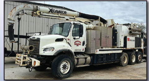
'12 FREIGHTLINER WITH VAC-CON HYDROEXCAVATOR

2012 FREIGHTLINER Model M2106V Tri-Axle Hydro Excavation Truck , powered by Cummins Recon ISC, 300HP diesel engine and Allison 3000RDS automatic transmission, equipped with Vac-Con model VX312LXE Hydroexcavator body, s/n 03126134,