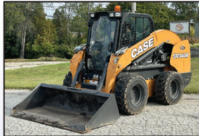
23 CASE SV340B

2023 CASE Model SV340B Skid Steer Loader , s/n NPM431222, powered by Case diesel engine and 2-speed hydrostatic transmission, equipped with 78" general purpose loader bucket, power coupler, hi-flow/hi-pressure auxiliary hydraulics, 10-pin electrics, pattern changer, joystick controls, ride control, creep mode, self leveling bucket, rear camera, enclosed ROPS cab with air conditioning, and 12x16.5 tires. In excellent condition with very good tires. (Meter Reads 284 Hours) (Has Title) (Purchased New)