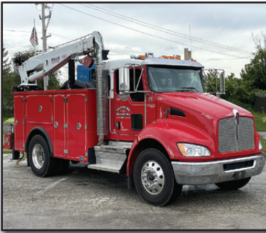
'22 KENWORTH T270

2022 KENWORTH Model T270 Single Axle Service Truck , powered by Paccar PX-9, 330 hp diesel engine and Allison automatic transmission, equipped with Stellar 11' service body, Stellar 12621, 12,000 lb 3-stage crane, American Eagle 46P air compressor, Miller welder, product tanks, differential lock, engine brake, work bumper and vise, aluminum wheels, air conditioning, cruise control, power windows and locks, airbrakes, 26,000 lb GVWR, and 11R22.5 tires. In very good condition with very good tires. (Odometer Reads 43,065 Miles) (Meter Reads 2,042 Hours) (Purchased New)