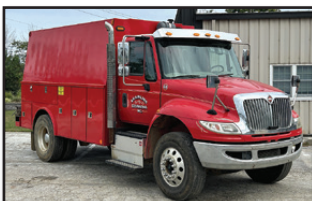
16 INTERNATIONAL 4300

2016 INTERNATIONAL Model 4300 Utility Truck , powered by Cummins ISB6.7, 280HP diesel engine and automatic transmission, equipped with Reading 12' walk-in utility body, Vanair PTO air compressor, 150 PSI, rear air outlets, (jackhammer capable), 2.5KW power inverter, engine brake, locking differentials, LED traffic signal light bars, air brakes, aluminum wheels, dual rear wheels, power windows and locks, cruise control, 25,999 lb GVWR, and 11R22.5 tires. In good condition with good tires. (Odometer Reads 71,419 Miles) (Meter Reads 7,328 Hours) (Purchased New)