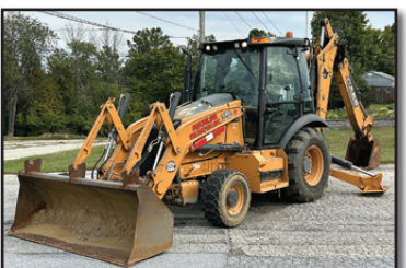
16 CASE 580SN, 4X4 EXTEND-A-HOE

2016 CASE Model 580SN, 4x4 Tractor Loader Extend-A-Hoe , s/n 721120, powered by Case diesel engine and shuttle transmission, equipped with general purpose loader bucket, 24" digging bucket, 4-stick backhoe controls, rear manual coupler, rear auxiliary hydraulics, ride control, enclosed ROPS cab with air conditioning, 12x16.5 front and 19.5L24 rear tires. In good condition with fair tires. (Meter Reads 4,926 Hours) (Purchased New)