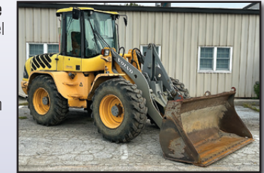
06 VOLVO L45B-TP

2006 VOLVO Model L45B-TP Rubber Tire Loader , s/n 1951954, powered by Volvo diesel engine and powershift transmission, equipped with general purpose loader bucket, hydraulic coupler, front auxiliary hydraulics, enclosed ROPS cab, and 17.5-25 tires. In good condition with good to very good tires. (Meter Reads 8,808 Hours) (Purchased New)