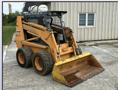
00 CASE 1854C

2000 CASE Model 1854C Skid Steer Loader , s/n JAF0314710, powered by Case diesel engine and hydrostatic transmission, equipped with 72" general purpose loader bucket, manual coupler, hi-flow hydraulics, roof top poly water tank, ROPS canopy. In fair to good condition with fair tires. (Meter Reads 1,680 Hours) (Purchased New)