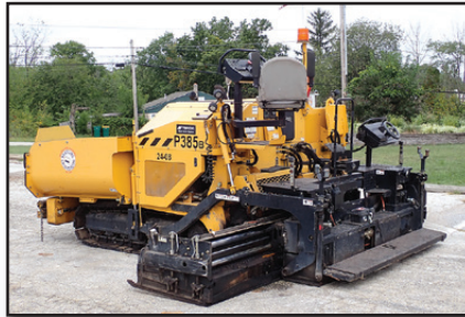
'19 WEILER P385B

1998 DYNAPAC Model CC122, 12 Series Tandem Vibratory Roller , s/n 60113691, powered by Deutz diesel engine and hydrostatic transmission, equipped with 46" smooth drums, drum selector, and water system. In good condition. (Meter Reads 4,498 Hours)