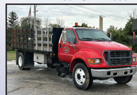
(1) OF (2) 03 FORD F-650s

2003 FORD Model F-650XLT Super Duty Stake Body Truck , powered by Cat 3126 diesel engine and automatic transmission, equipped with 21' stake body with lift gate, ratchet straps, dual rear wheels, hydraulic brakes, cruise control, air conditioning, and 10R22.5 tires. In good condition with good tires. (Odometer Reads 335,959 Miles)