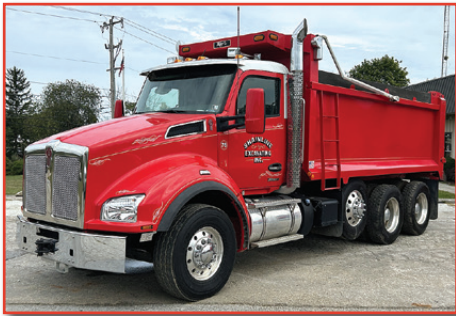
'23 KENWORTH T-880 (30,896 MILES)

PRE-SORTED FIRST CLASS MAIL US POSTAGE PAID UPPER DARBY, PA PERMIT #45