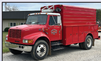
(1) OF (2) 99 INT'L 4700s

1999 INTERNATIONAL Model 4700 Utility Truck , powered by Int'l DT466 diesel engine and Int'l 6 Plus manual transmission, equipped with Reading 12' walk-in utility body, Vanair PTO air compressor, rear air outlets (jackhammer capable), 1,000 watt power inverter, hydraulic brakes, dual rear wheels, 25,500 lb GVWR, cruise control, air conditioning, and 11R22.5 tires. In good condition with good tires. (Odometer Reads 207,202 Miles) (Purchased New)