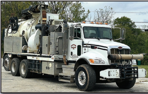
'18 PETERBILT 348 WITH VAC-CON HYDROEXCAVATOR

10' aluminum telescoping boom with 8" vacuum intake hose, 4,000 PSI/20GPM water system, 50' high-pressure hose reel and digging wand, steel dumping debris body with 8-jet power flush system, mounted on a Tri-Axle carrier with 40,000 lb rears, 20,000 lb front axle and 20,000 lb airlift tag axle, 80,000 lb GVWR. In good condition with good tires. (EGR Cooler Bad – Work In Progress – Current Meter Readings Unavailable) (Purchased in 2012 with 1,264 Miles / 60 Hours)