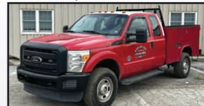
12 FORD F-350XL SD, 4X4

2012 FORD Model F-350XL Super Duty, 4x4 Extended Cab Utility Truck , powered by Powerstroke 6.7L diesel engine and automatic transmission, equipped with Reading 8' open utility body, 50 gallon fuel tank with 12 volt pump, and 275/70R18 tires. In good condition with good tires. (Odometer Reads 209,755 Miles)