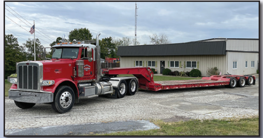
'16 PETERBILT 389 AND '88 TALBERT 50 TON

2016 PETERBILT Model 389 Tandem Axle Truck Tractor , powered by Cummins ISX15-550 diesel engine and Eaton Fuller 18 speed transmission, equipped with wetline, 46,000 lb rear axle, 14,320 lb front axle, double frame, sliding 5th wheel, full locking differentials, Air Trac air ride suspension, aluminum wheels and fenders, power windows and locks, heated power mirrors, cruise control, air conditioning, and 11R24.5 tires. In very good condition with very good tires. (34,862 Original Miles) (Meter Reads 2,381 Hours) (Purchased New)