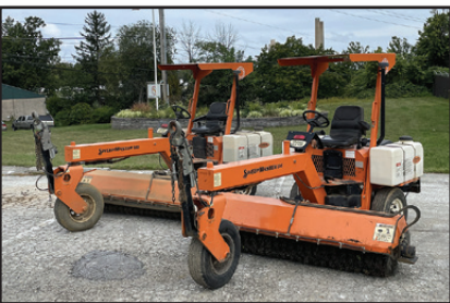
'16 LAYMOR SM300 BROOMS

2016 LAYMOR Model SM300 Broom, s/n 36884 , powered by Kubota diesel engine and hydrostatic transmission, equipped with 7.5' broom, power angle, spray system with twin poly water tanks, tow package, ROPS canopy, and 205/75R14 tires. In good condition with good tires. (Meter Reads 709 Hours) (Purchased New)