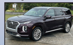
20 HYUNDAI PALISADE SUV

2020 HYUNDAI Model Palisade 4-Door SUV , powered by gas engine and automatic transmission, equipped with HTRAC all wheel drive, sunroof, full power package, leather interior, heated ventilated seats, and 245/50R20 tires. In good condition with good tires. (Odometer Reads 136,885 Miles) (Purchased New)