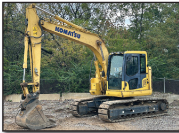
15 KOMATSU PC138USLC-10

2015 KOMATSU Model PC138USLC-10 Hydraulic Excavator , s/n 42112, powered by Komatsu diesel engine and hydraulic drive, equipped with 8' dipper stick, JRB hydraulic coupler, auxiliary hydraulics, Geith 36" digging bucket, 3rd valve for backfill blade with blade mounting brackets, rear camera, enclosed ROPS cab with air conditioning, and 20" street pads. In good condition with good undercarriage. (Meter Reads 5,001 Hours) (Purchased New)