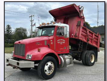
'04 PETERBILT 330

2004 PETERBILT Model 330 Single Axle Dump Truck , powered by Cat C7 diesel engine and Eaton Fuller 8LL, 10 speed transmission, equipped with Beau Roc 10' steel dump body, power tarp, central hydraulics, Meyer 10' snowplow, tow package with air, locking differentials, 23,000 lb rear axle, 10,000 lb front axle, Reyco spring suspension, 33,000 lb GVWR, air brakes, heated mirrors, cruise control, air conditioning, and 11R22.5 tires. In good condition with good tires. (Odometer Reads 21,507 Miles) (Meter Reads 3,518 Hours) (Purchased New)